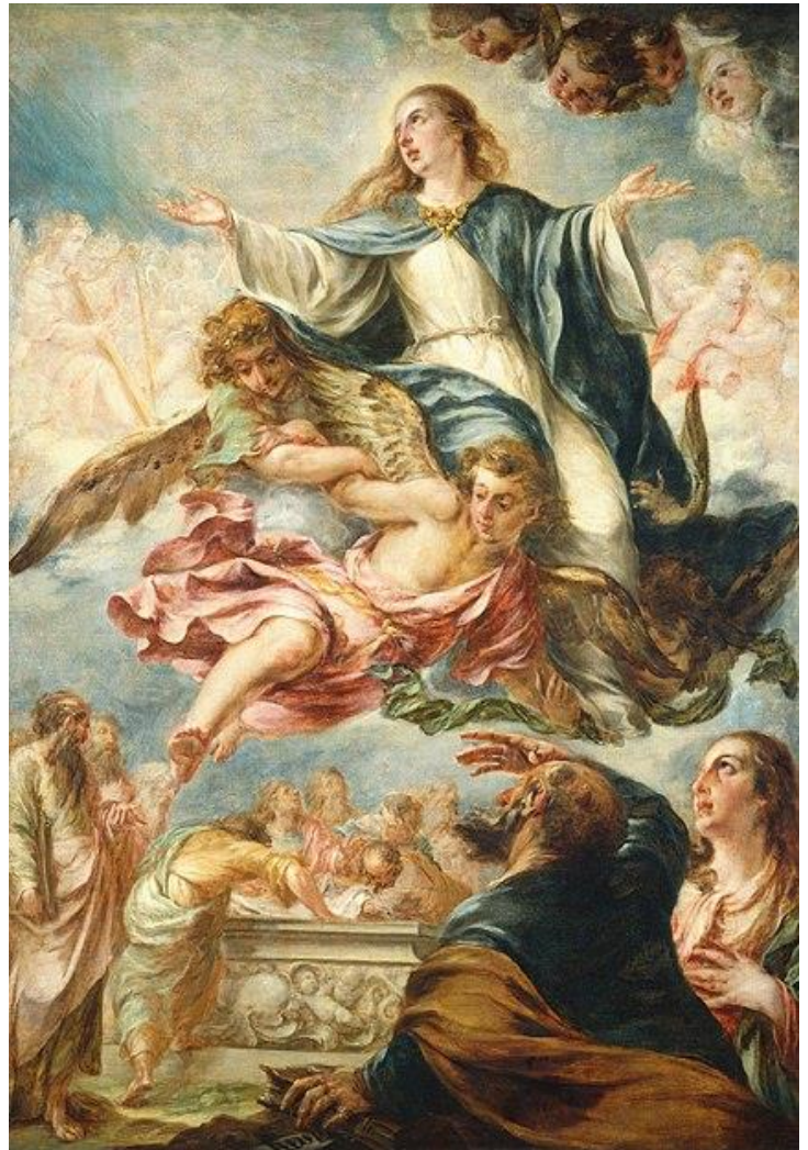
The Assumption of the Virgin Juan de Valdes Leal , 1658, -1660, National Gallery of Art, Washington DC ( public domain )

REMEMBER, O most gracious Virgin Mary, that never was it known that anyone who fled to thy protection, implored thy help, or sought thy intercession was left unaided. Inspired with this confidence, I fly to thee, O Virgin of virgins, my Mother; to thee do I come; before thee I stand, sinful and sorrowful. O Mother of the Word Incarnate, despise not my petitions, but in thy mercy hear and answer me. Amen.