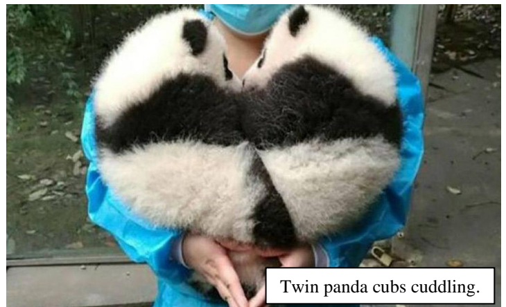
Twin panda cubs cuddling.