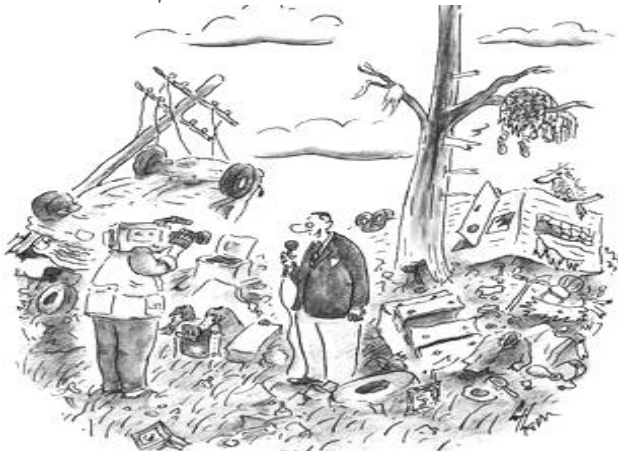
“But the weather’s great the rest of the week.”