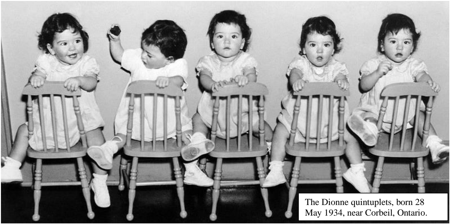
The Dionne quintuplets, born 28 May 1934, near Corbeil, Ontario.