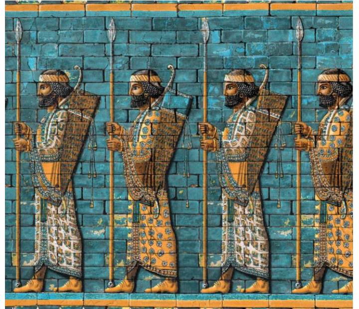
Above: Babylonian bas-relief wall art . Below: Reproduction of Babylon , c. 560 BC