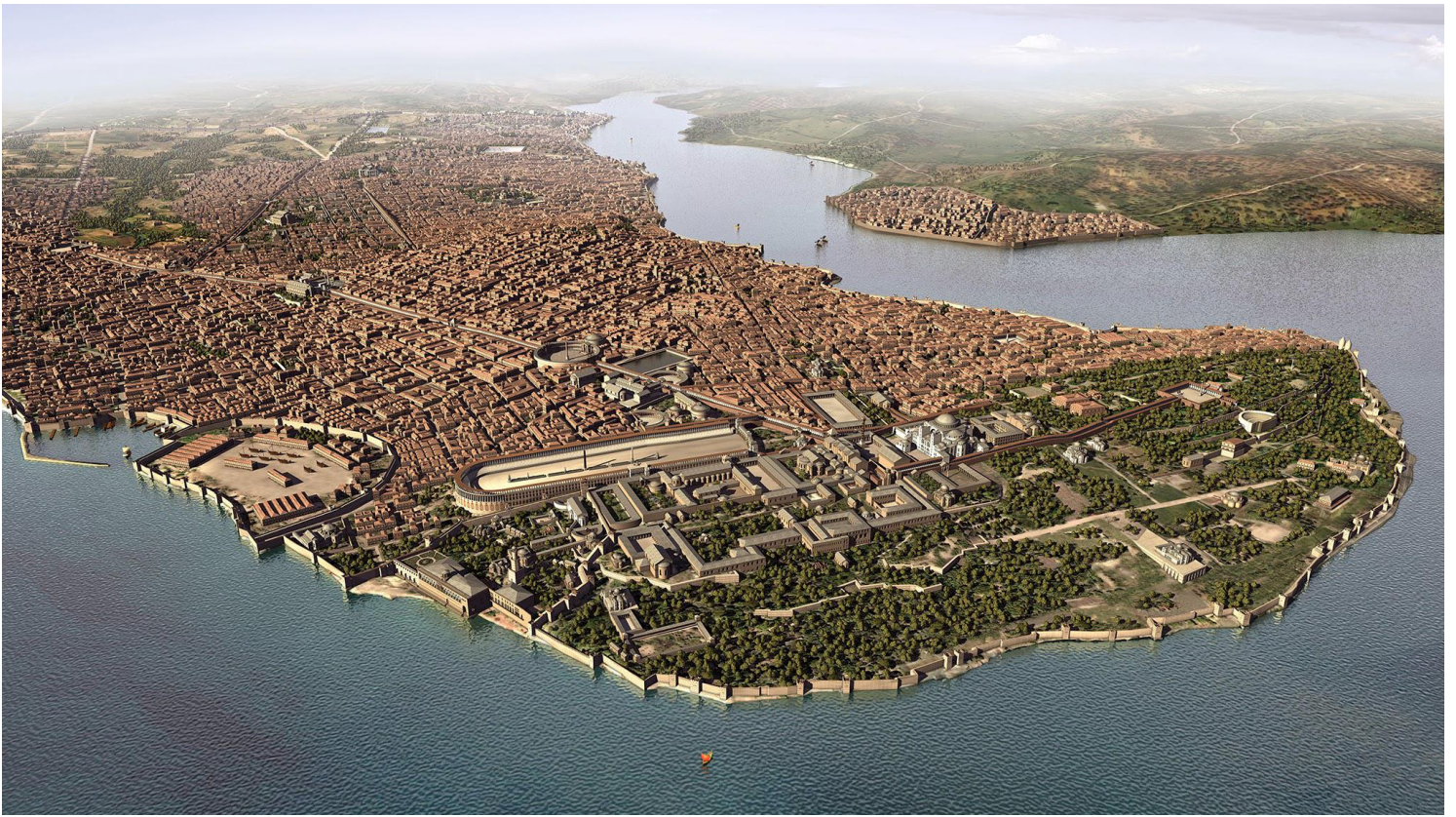
Above: Constantinople, 1422 Below: Istanbul (same city), 2022