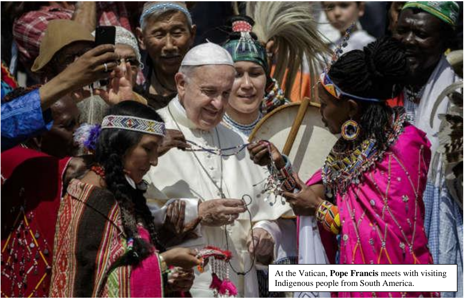
At the Vatican, Pope Francis meets with visiting Indigenous people from South America.