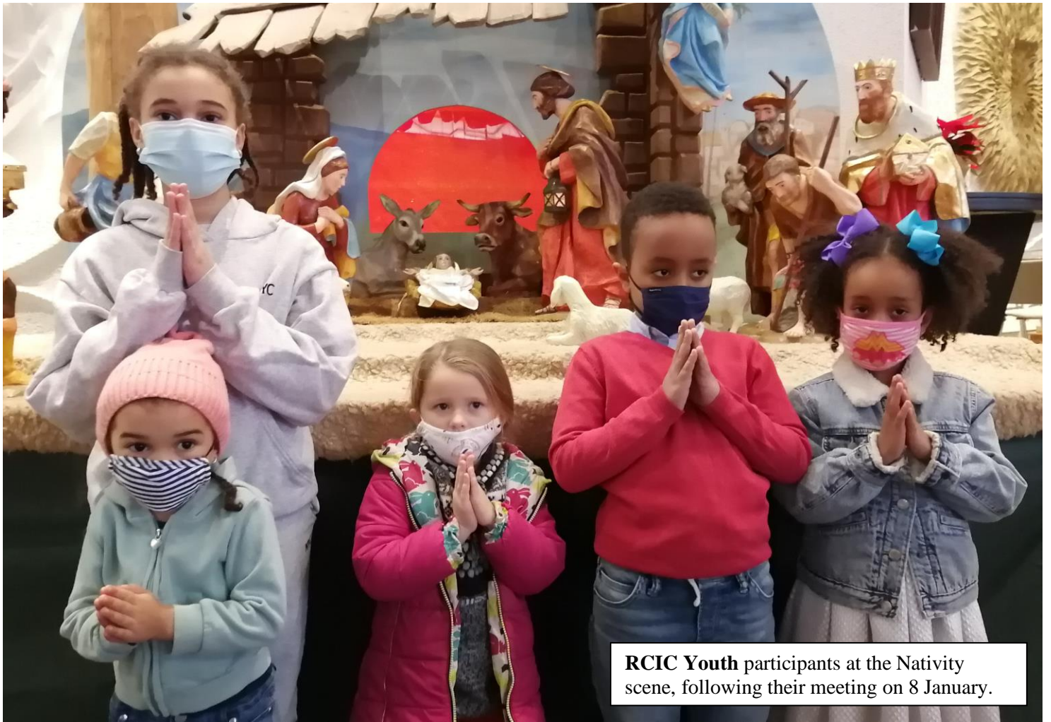
RCIC Youth participants at the Nativity scene, following their meeting on 8 January.