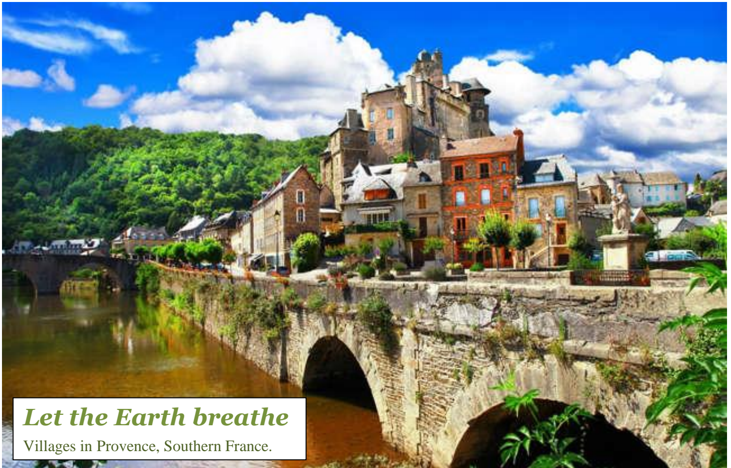
Let the Earth breathe Villages in Provence, Southern France.