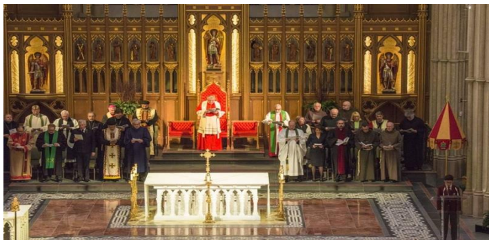
[Photo above: The observance of this Week of Prayer in 2017, prior to the pandemic, hosted by Cardinal Collins at St. Michael Cathedral.]

We remember in our Intercessions this important annual event.