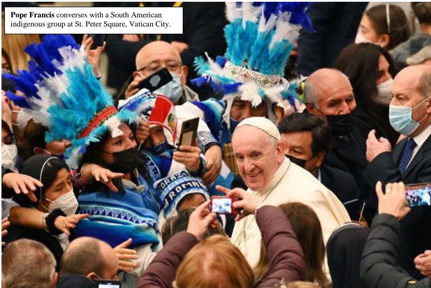
Pope Francis converses with a South American indigenous group at St. Peter Square, Vatican City.