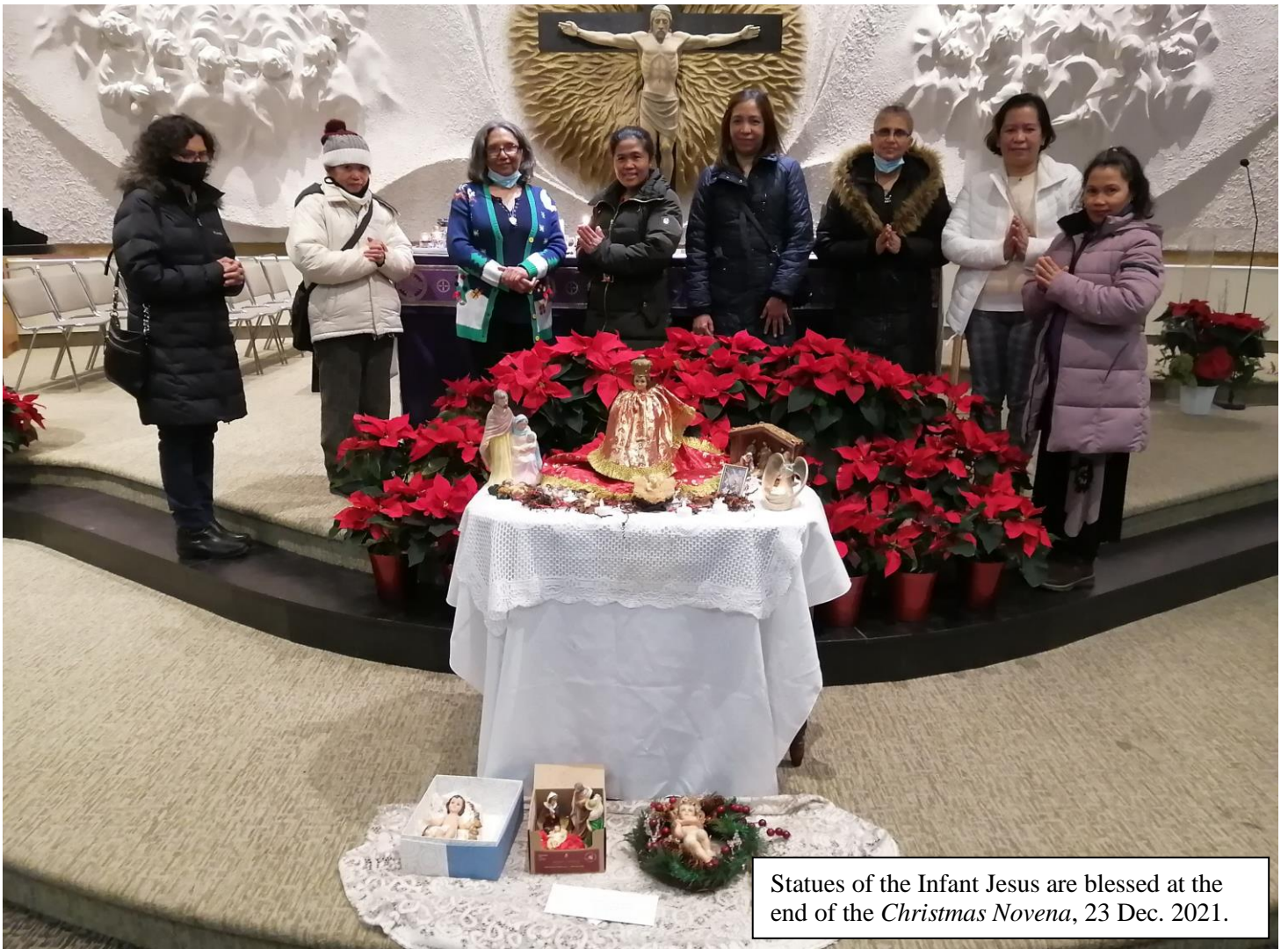
Statues of the Infant Jesus are blessed at the end of the Christmas Novena , 23 Dec. 2021.