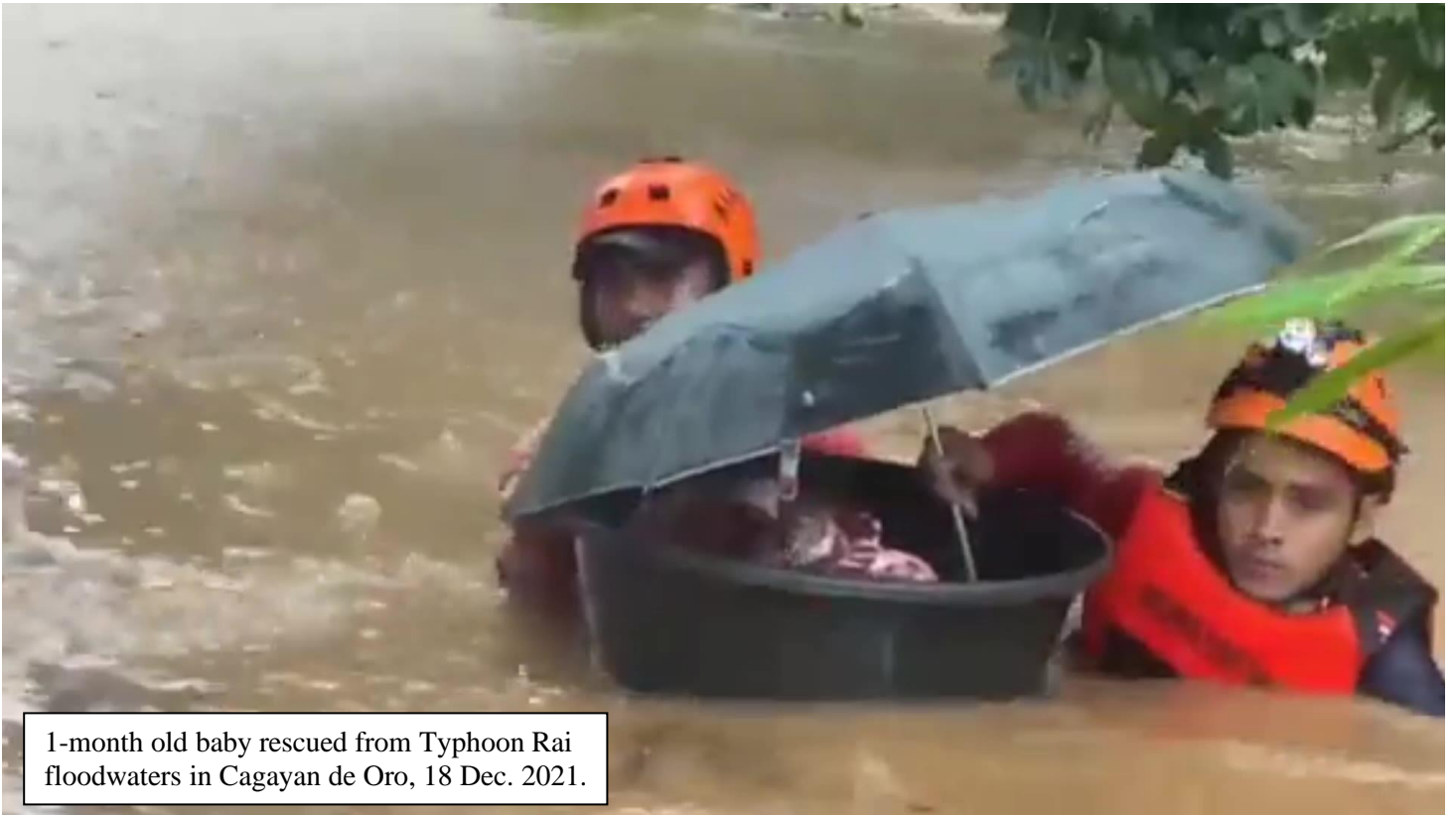
1-month old baby rescued from Typhoon Rai floodwaters in Cagayan de Oro, 18 Dec. 2021.