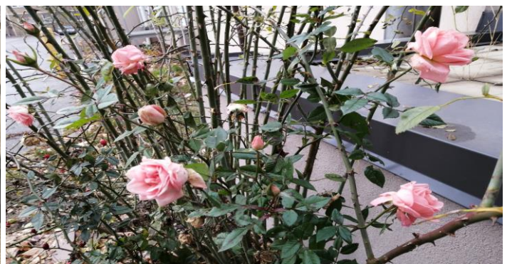
Christmas flowers for the Church: a welcome gift.