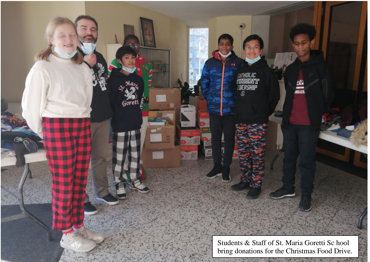
Students & Staff of St. Maria Goretti Sc hool bring donations for the Christmas Food Drive.