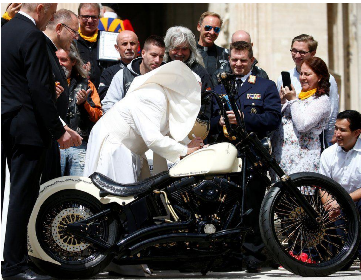
Below: Pope Francis signs a Harley Davidson motorbike for the Christian motorcycle group Jesus Biker, as his cape is blown by the wind during the general audience at the Vatican, 29 May 2019.