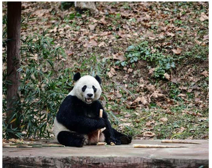
Below: U.S.-born giant panda Bei Bei eats bamboo after arriving at his new home in China at the Ya'an Bifengxia Base of the Giant Panda Conservation and Research Center on 21 November 2019.