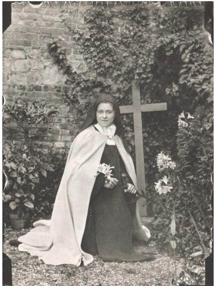
Ste. Thérèse of Lisieux in the convent garden. She wrote: How often have I thought that I may owe all the graces I have received to the prayers of a person who begged them from God for me, and whom I shall know only in Heaven.