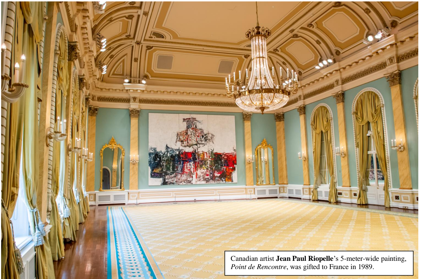
Canadian artist Jean Paul Riopelle 's 5-meter-wide painting, Point de Rencontre , was gifted to France in 1989.