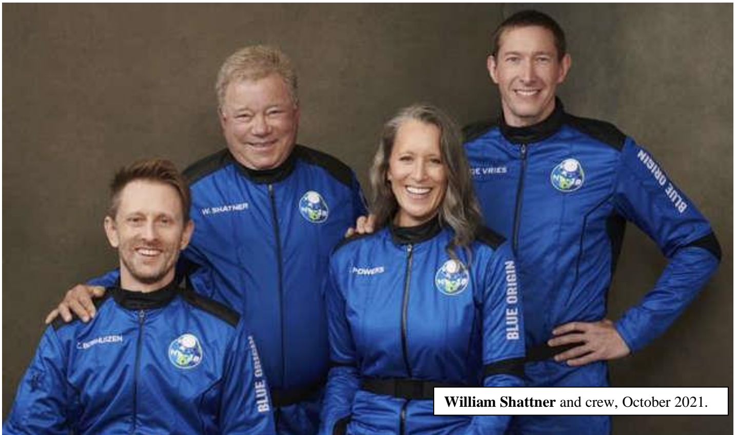
William Shattner and crew, October 2021.