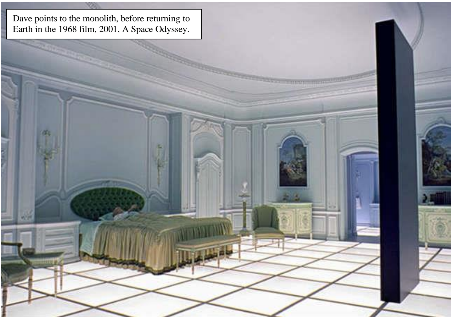
Dave points to the monolith, before returning to Earth in the 1968 film, 2001, A Space Odyssey.