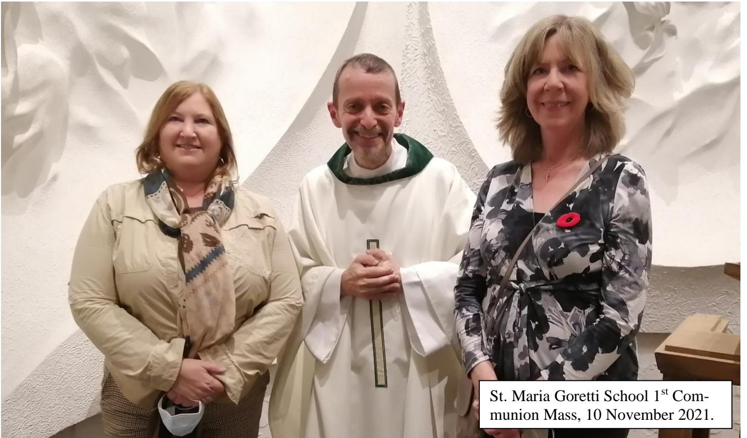
St. Maria Goretti School 1 st Communion Mass, 10 November 2021.