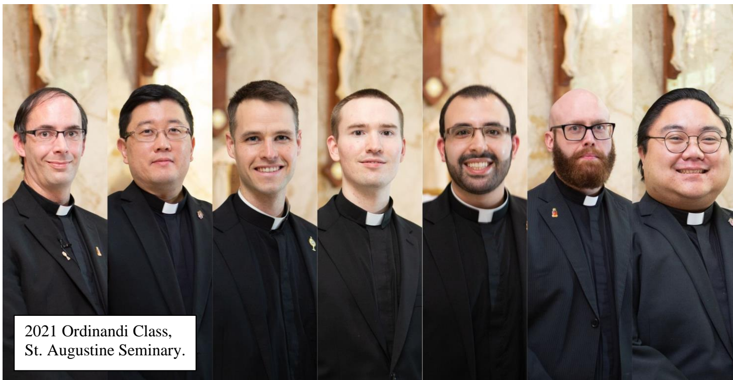
2021 Ordinandi Class, St. Augustine Seminary.