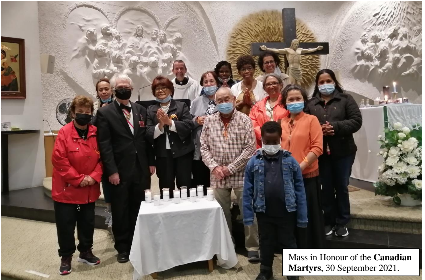
Mass in Honour of the Canadian Martyrs , 30 September 2021.