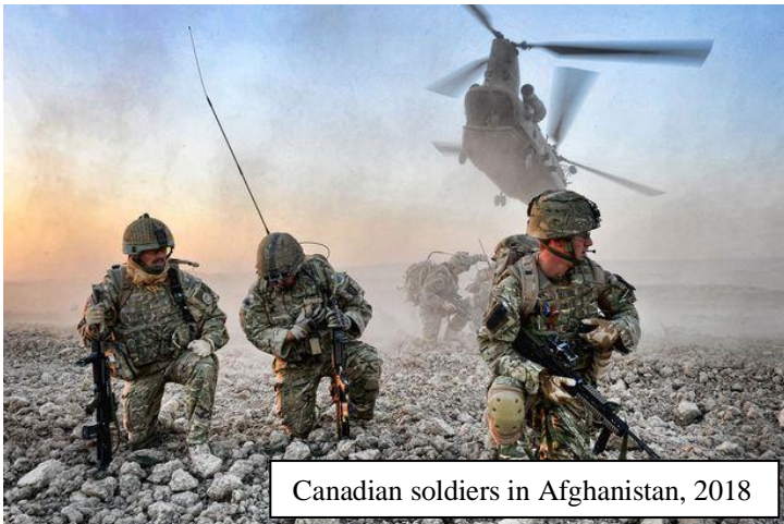
Canadian soldiers in Afghanistan, 2018

In Flanders fields the poppies blow, Between the crosses, row on row, That mark our place; and in the sky The larks, still bravely singing, fly Scarce heard amid the guns below.