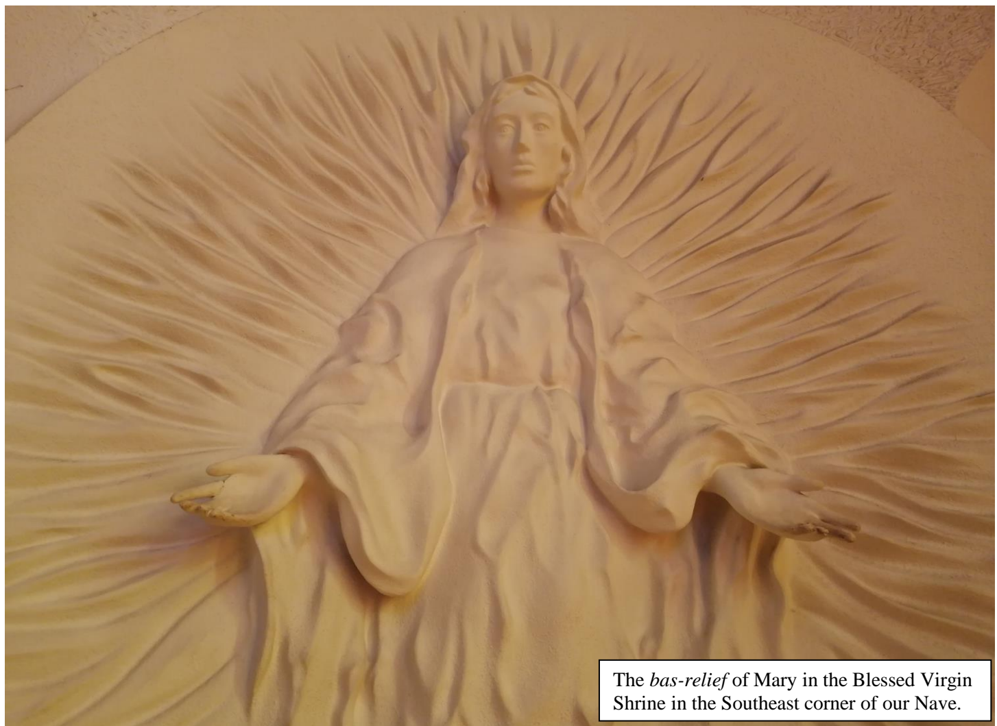
The bas-relief of Mary in the Blessed Virgin Shrine in the Southeast corner of our Nave.