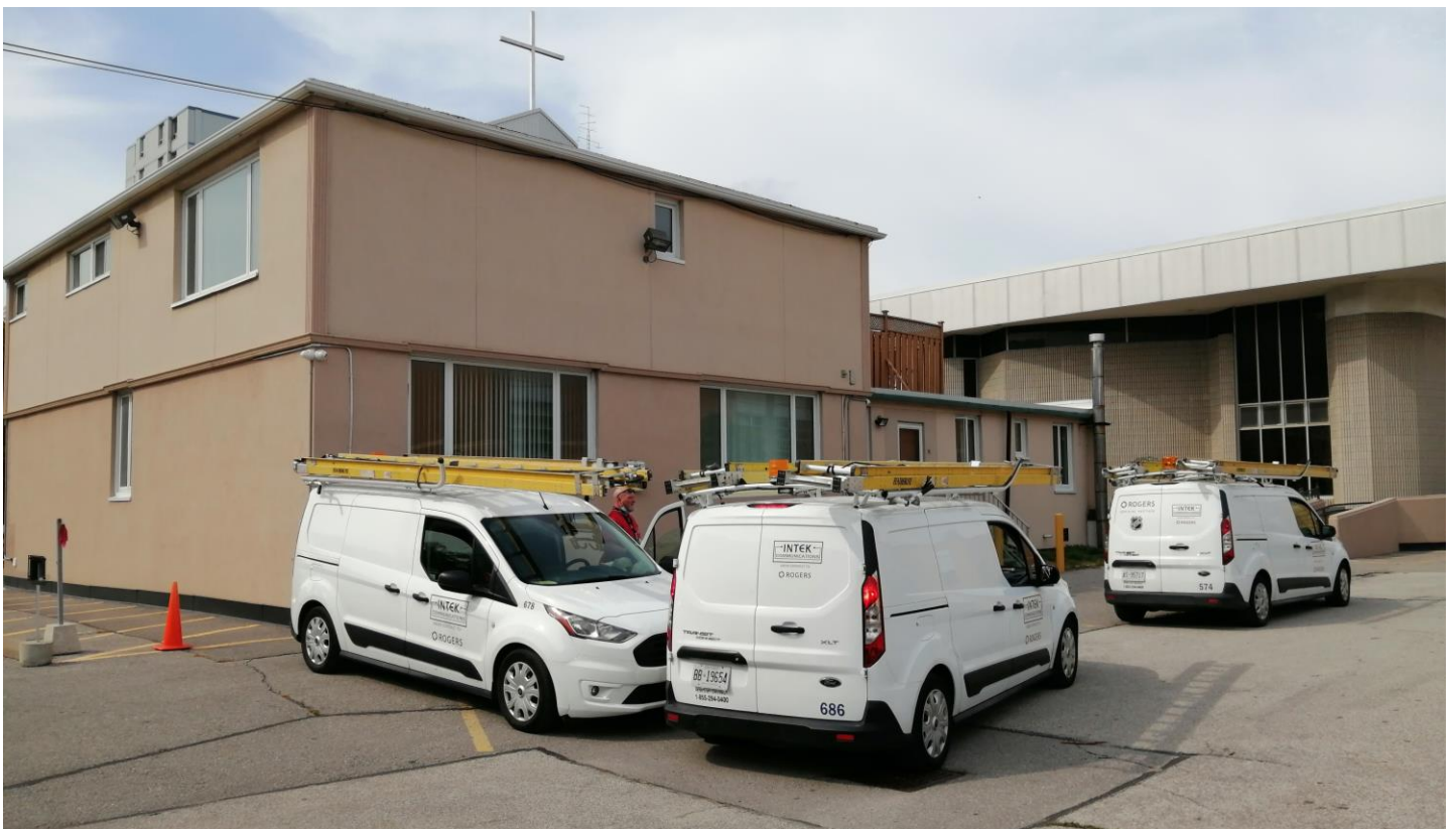
[Below] Repair Rodeo: 3 Intek vehicles, subcontracted by Rogers, gather after conducting a major repair job on our exterior cable, which keeps getting chewed up by squirrels.