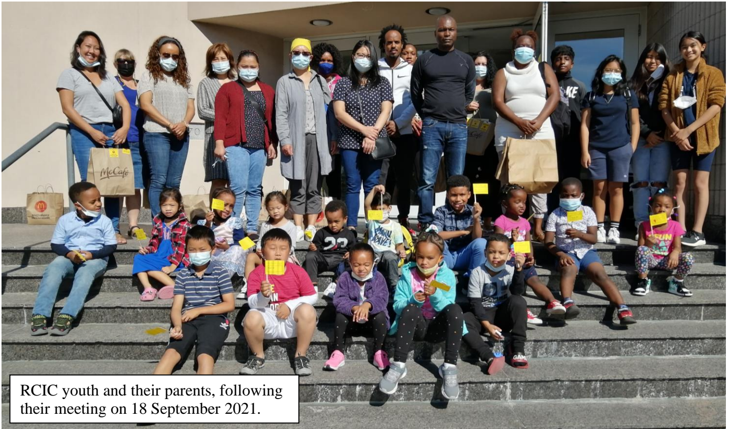
RCIC youth and their parents, following their meeting on 18 September 2021.