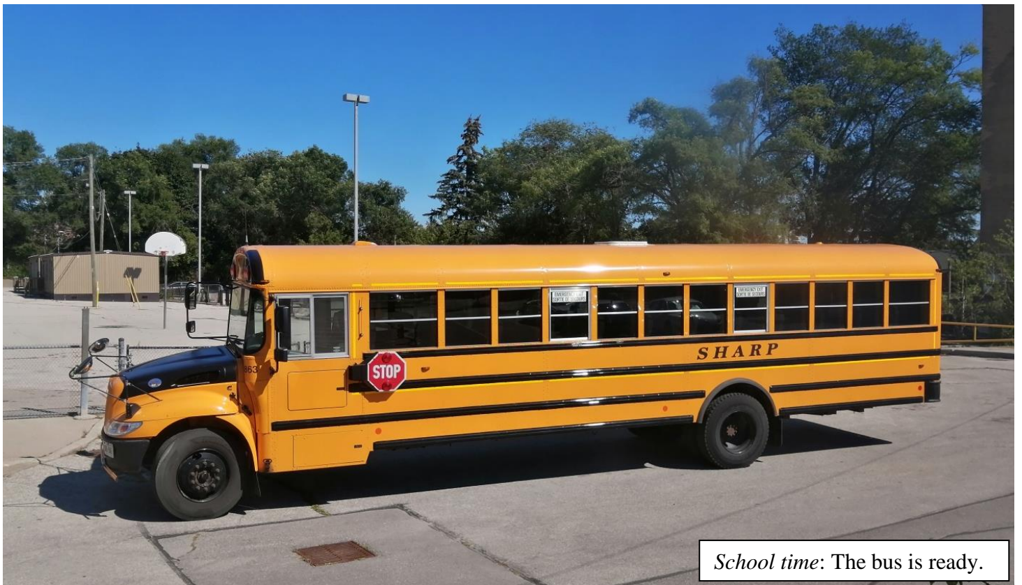
School time: The bus is ready.