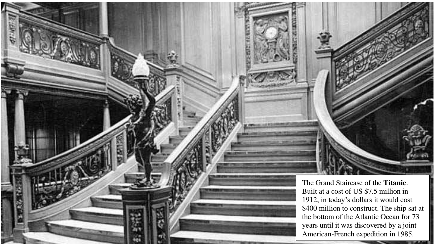
The Grand Staircase of the Titanic . Built at a cost of US $7.5 million in 1912, in today's dollars it would cost $400 million to construct. The ship sat at the bottom of the Atlantic Ocean for 73 years until it was discovered by a joint American-French expedition in 1985.