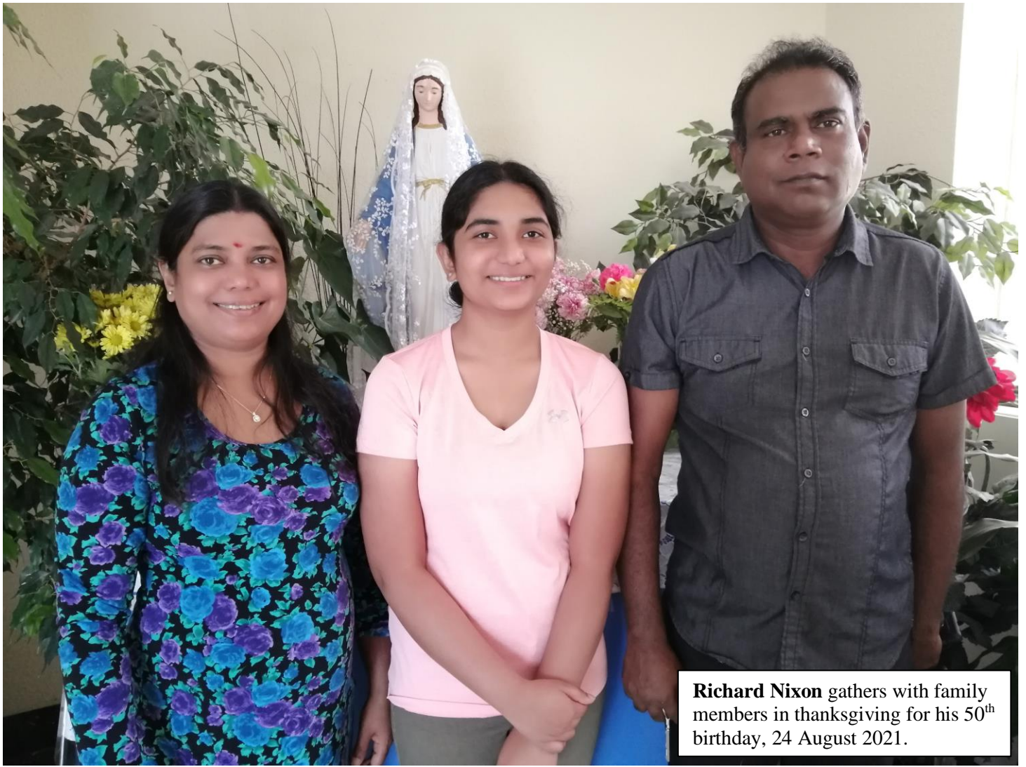
Richard Nixon gathers with family members in thanksgiving for his 50 th birthday, 24 August 2021.