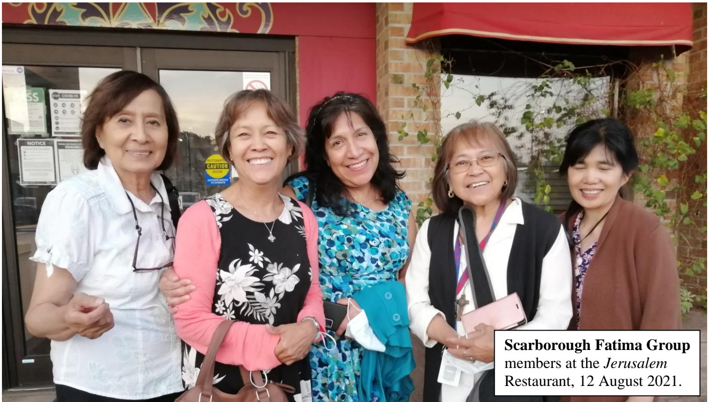
Scarborough Fatima Group members at the Jerusalem Restaurant, 12 August 2021.