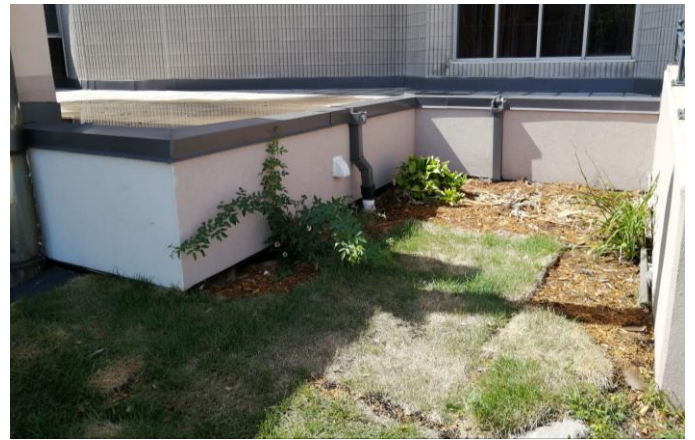
Above: Rose bush beside ramp, in August 2020. Below: Same bush, in August 2021.