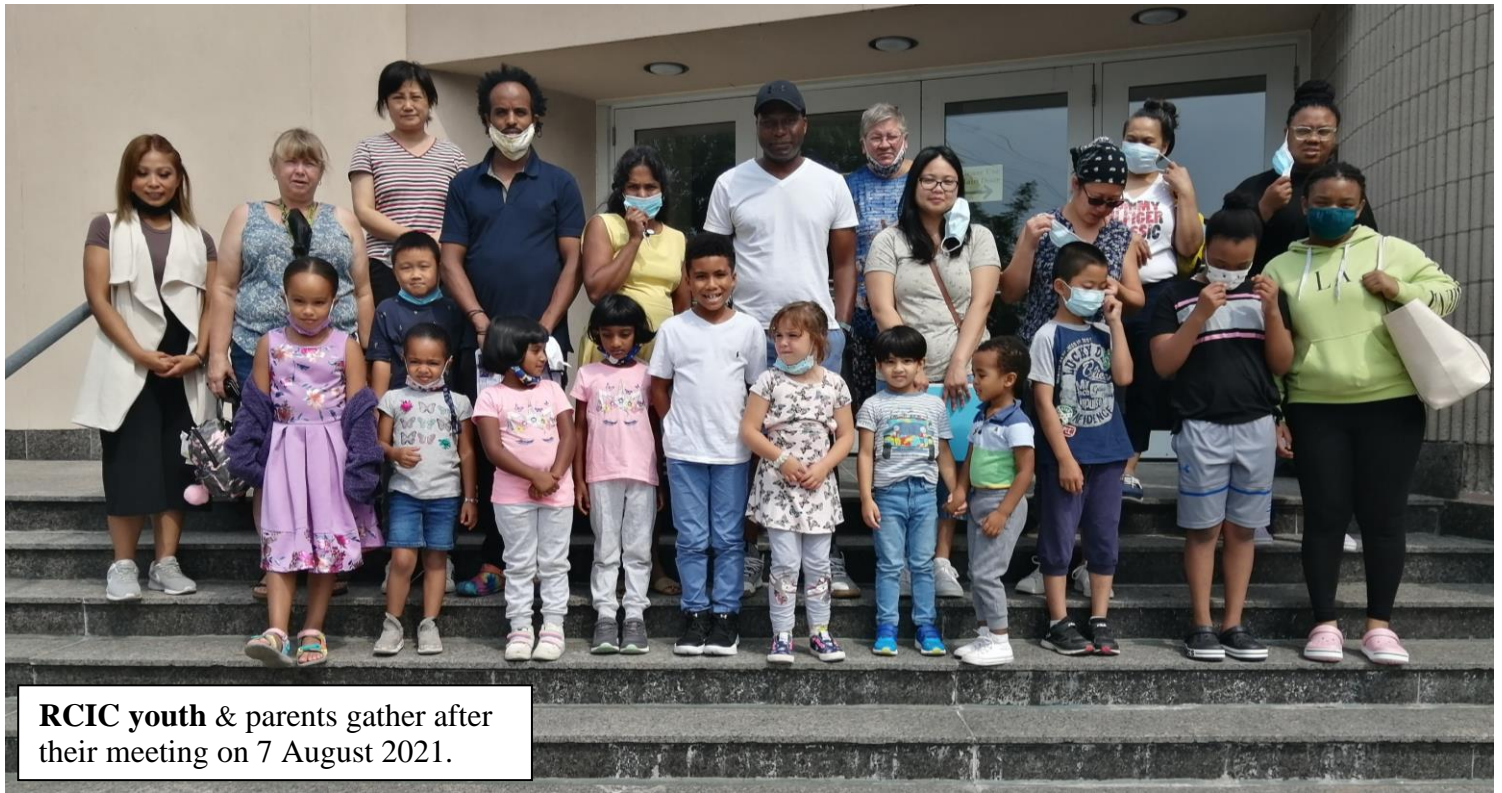
RCIC youth & parents gather after their meeting on 7 August 2021.