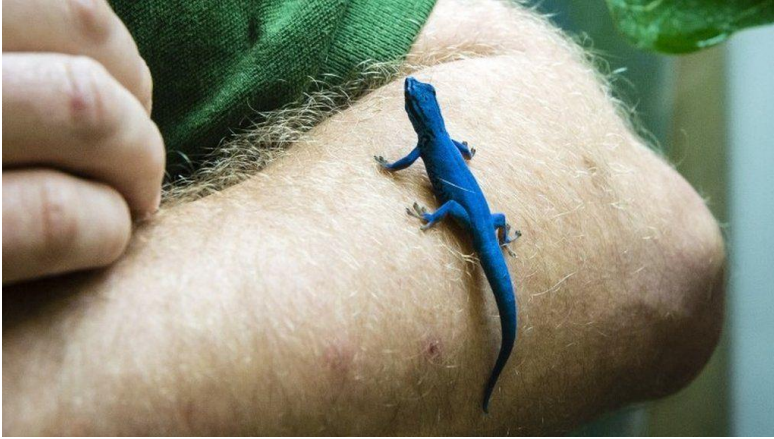
Above: Electric Blue Gecko Below: Baby Porcupine