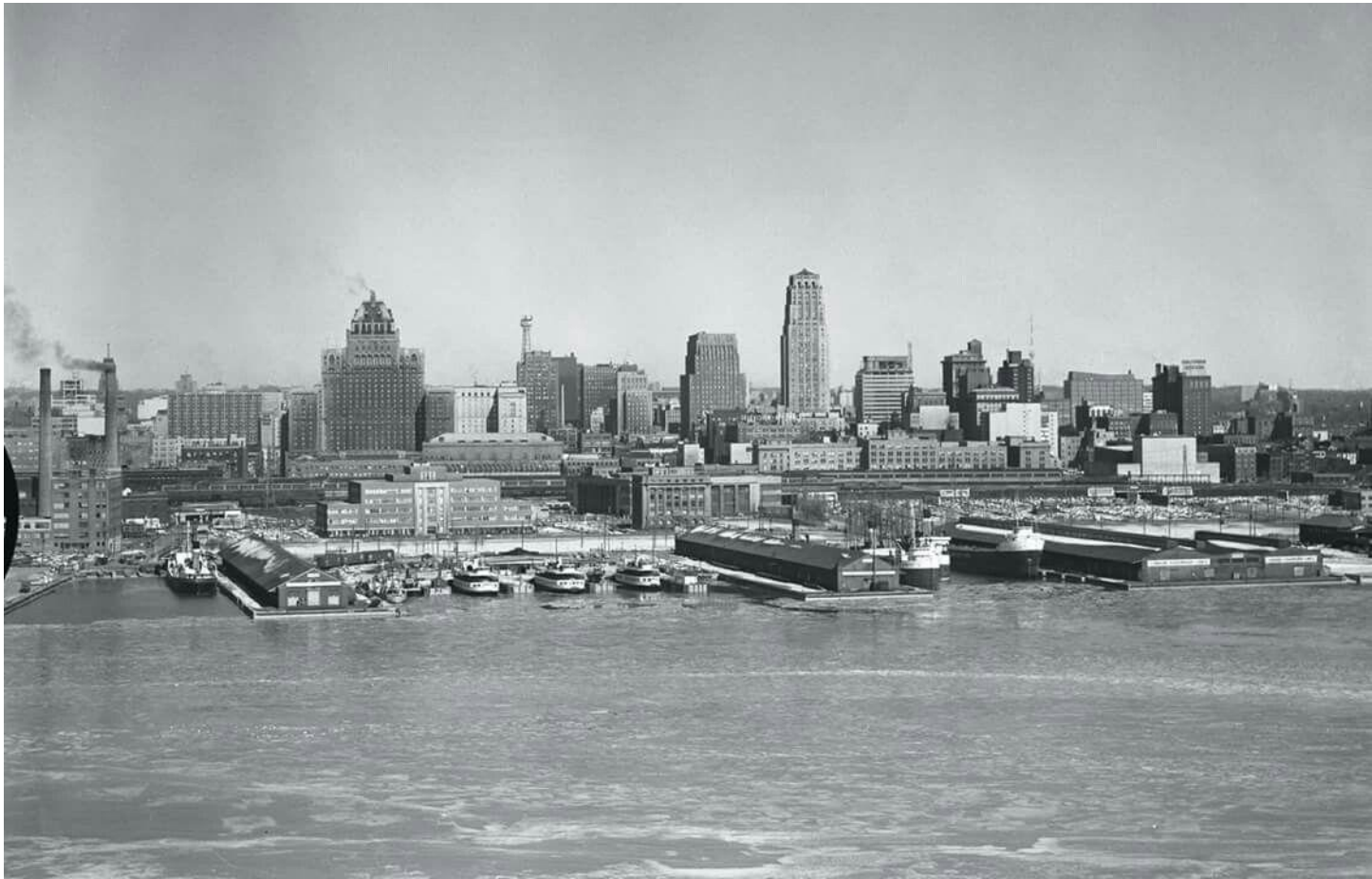
The Skyline Above – 1935; Below – 2015