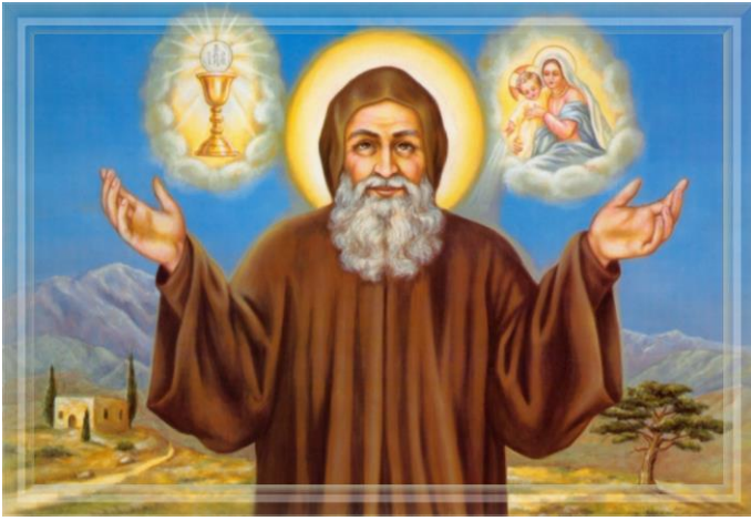
St. Charbel Makhlouf, the Miracle Monk of Lebanon