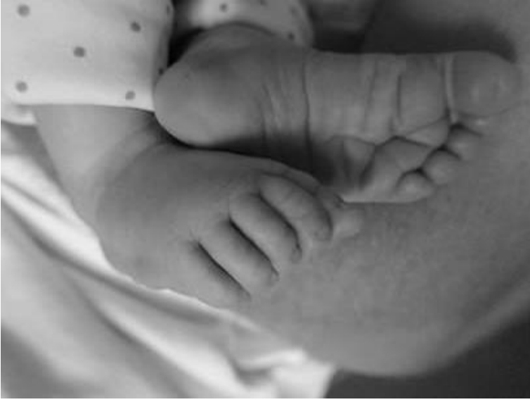
David Pastrnak's boy's feet. David, a Boston Bruin, lost his baby boy at the age of 6 days.