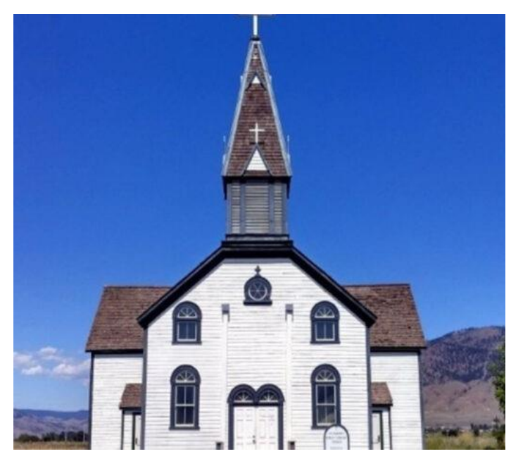
St. Joseph Mission Church, Tkemlúps te Secwépemc Indian Band Land

The global pandemic caused by COVID-19 has stalled this project; however, the Bishops remain committed to moving forward with the delegation prior to the end of 2021, in compliance with international travel guidelines.