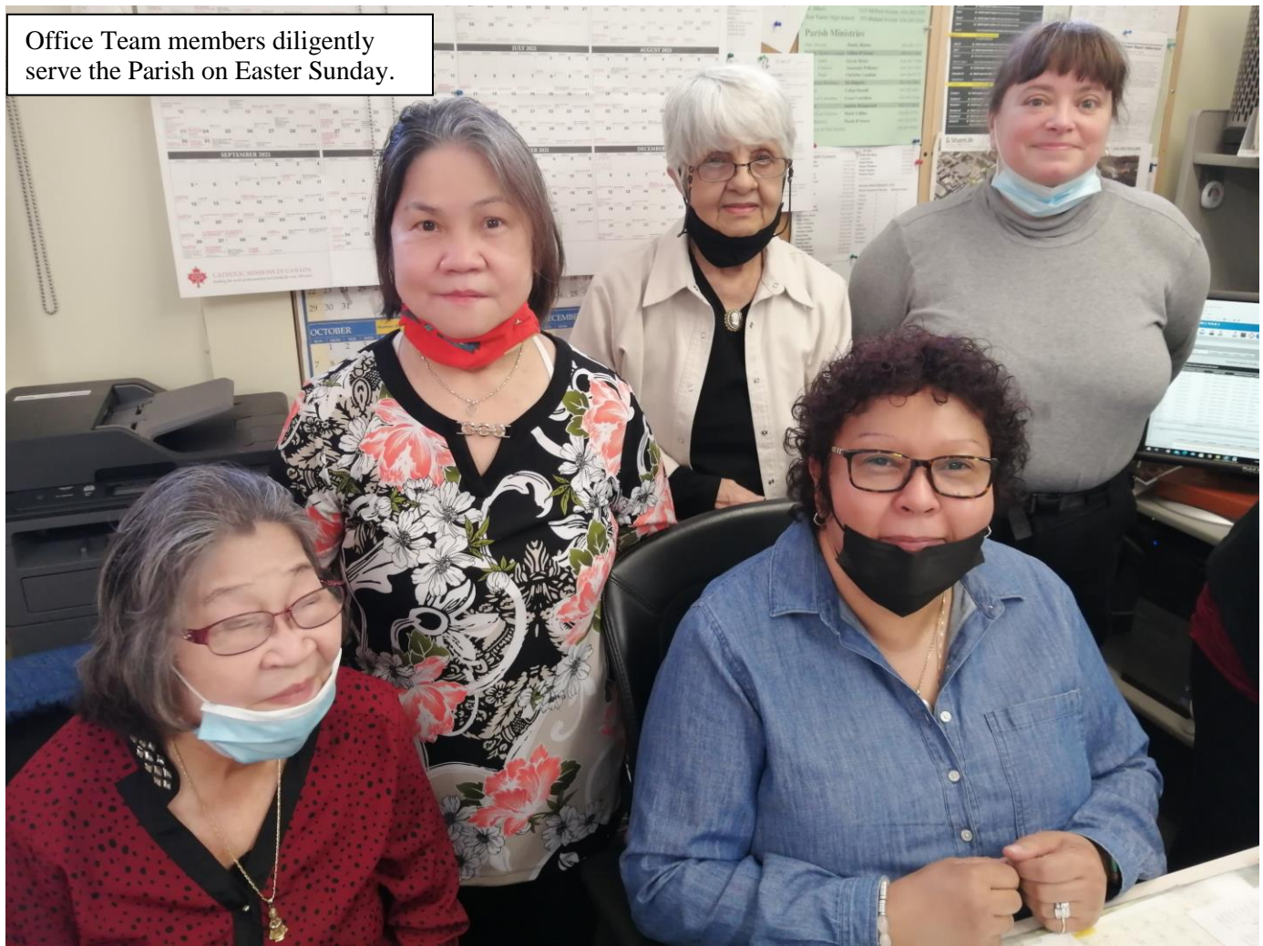
Office Team members diligently serve the Parish on Easter Sunday.