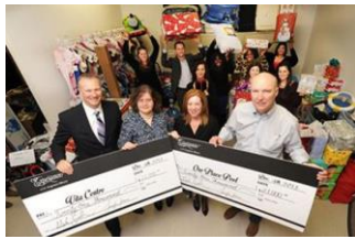
Vita Centre, Mississauga

Vita Centre is an agency funded by ShareLife that provides support, education and counselling for pregnant and parenting women in Peel.