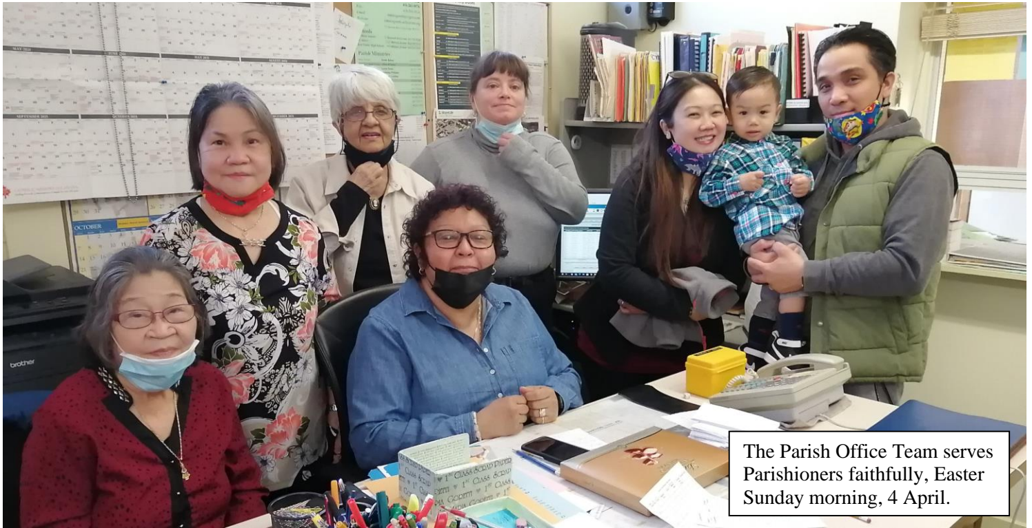
The Parish Office Team serves Parishioners faithfully, Easter Sunday morning, 4 April.