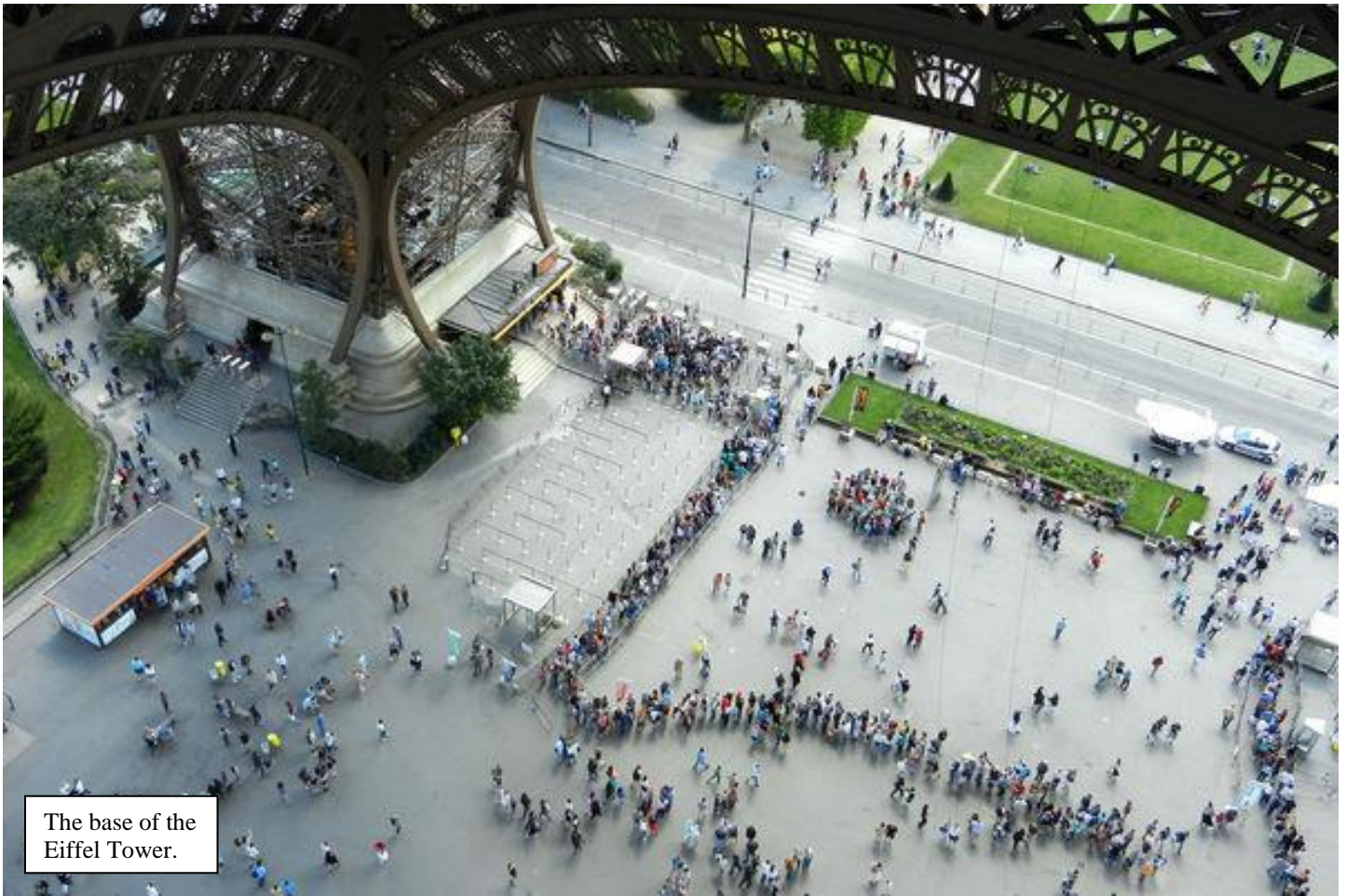
The base of the Eiffel Tower.