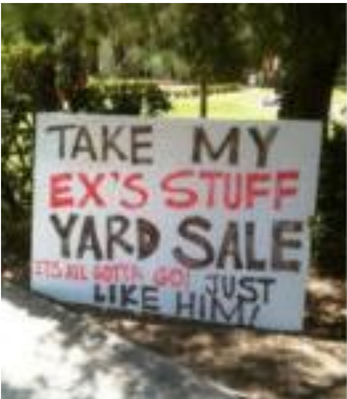
Below: The Generation Gap shows its head.