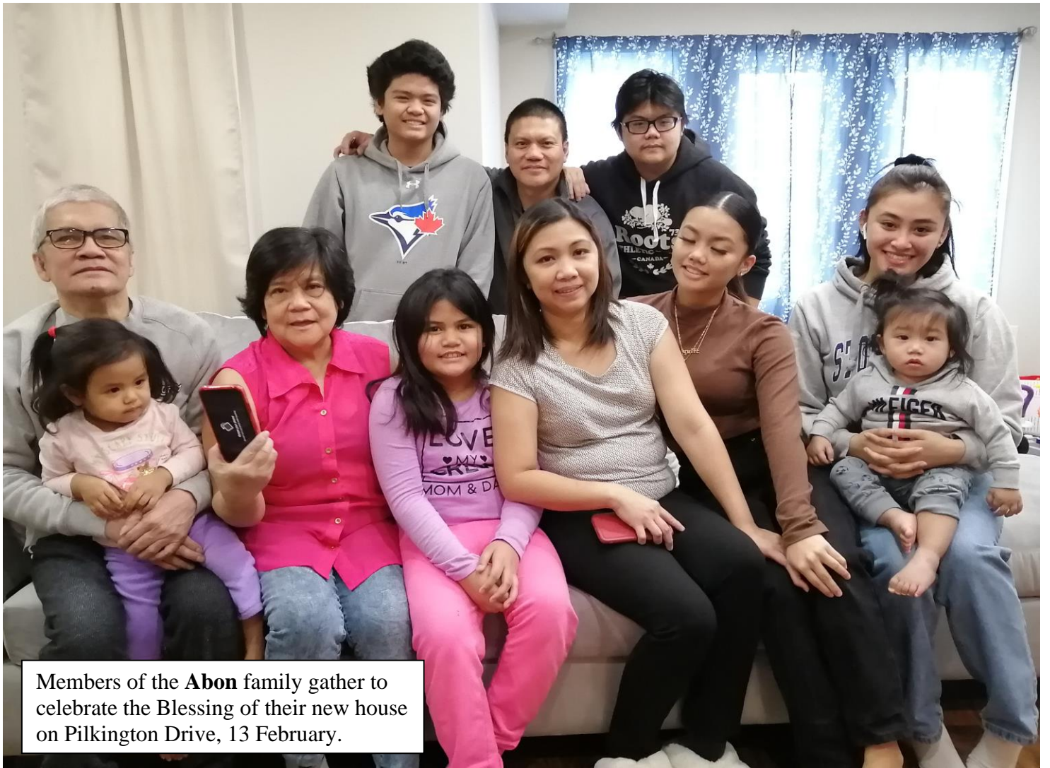
Members of the Abon family gather to celebrate the Blessing of their new house on Pilkington Drive, 13 February.