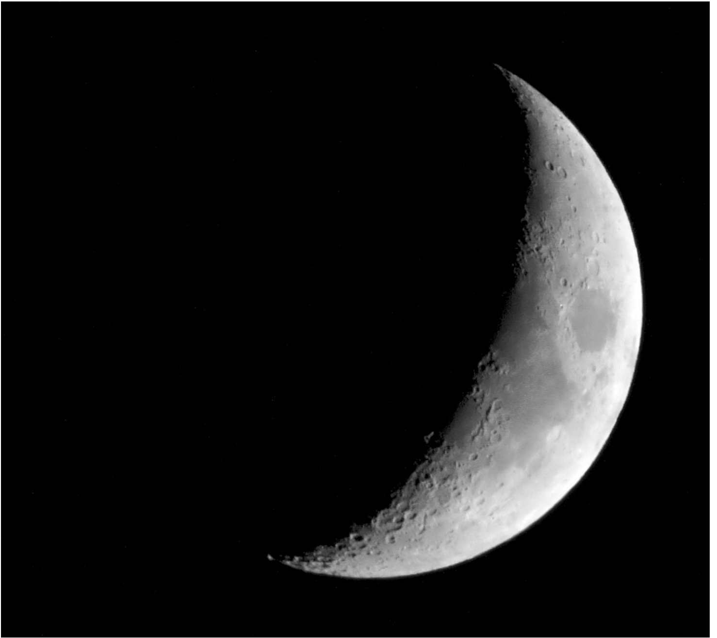
Above: AUTUMN MOON, 21 September 2020 (Lorenzo Berardinetti)