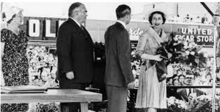
1959 Queen Elizabeth at the new Golden Mile Plaza.