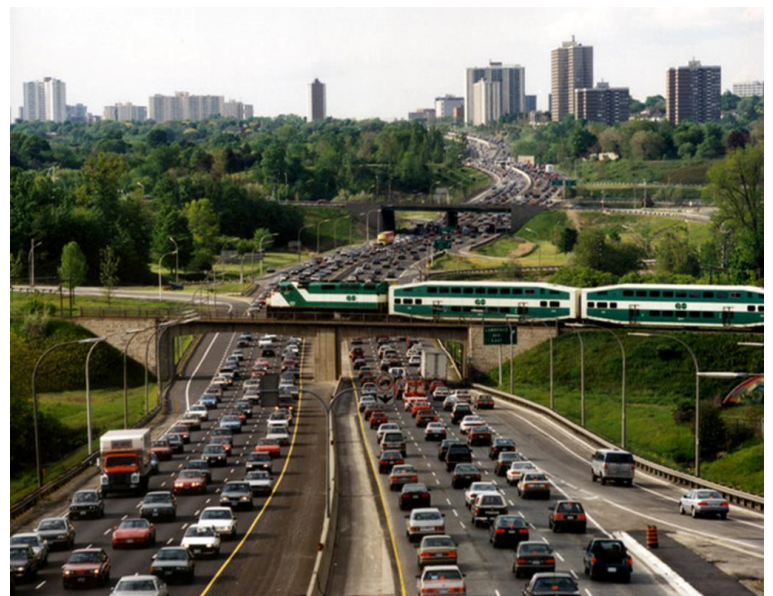
Map and photos: The Don Valley before the Parkway, when the Parkway opened, and the Parkway today.

The original five-mile stretch of the Don Valley Parkway that opened on 31 August 1961 ran from Bloor Street up to Eglinton Avenue. North and South of these ends, work was already underway on additional phases that would reach the Gardiner to the South, and the 401 to the North.