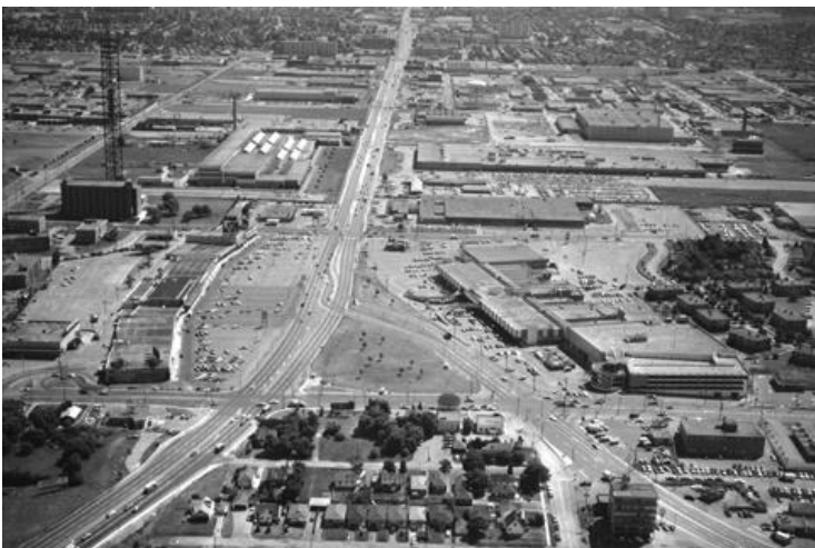
1975 O'Connor Drive meets Eglinton Ave. E., with the Golden Mile Plaza on the left, and Eglinton Square at the right.

Photos of Eglinton Avenue, looking East, from Victoria Park Avenue. In 1949, traffic had to use O'Connor to head downtown, since Eglinton Avenue (like all the main East-West Streets) did not cross the Don Valley. Eglinton and Lawrence and Sheppard, etc., were all connected over the Don River when the Parkway was built.