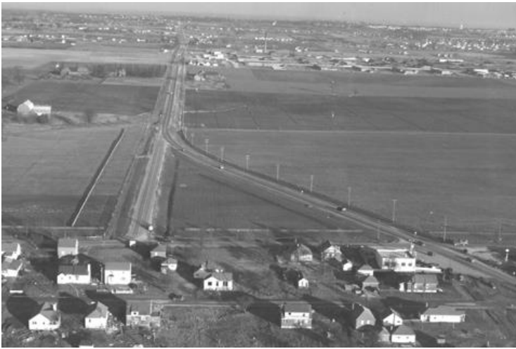
1949 O'Connor Drive turns onto Eglinton Ave. heading East.