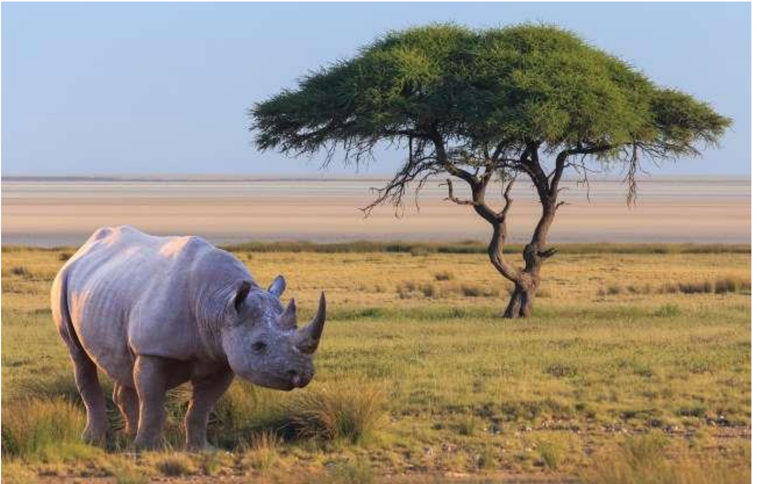
Above: Africa healing during the pandemic. [Sergey Gaydaburov]