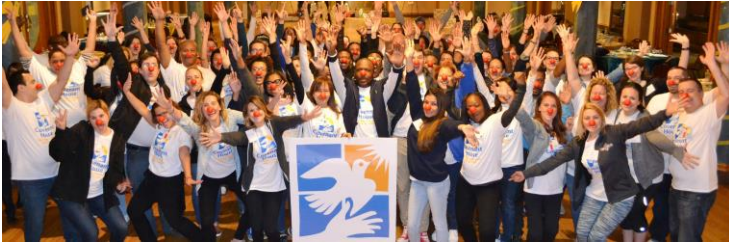
Photos above: COVENANT HOUSE helps homeless youth to leave the street, and find safety and guidance.