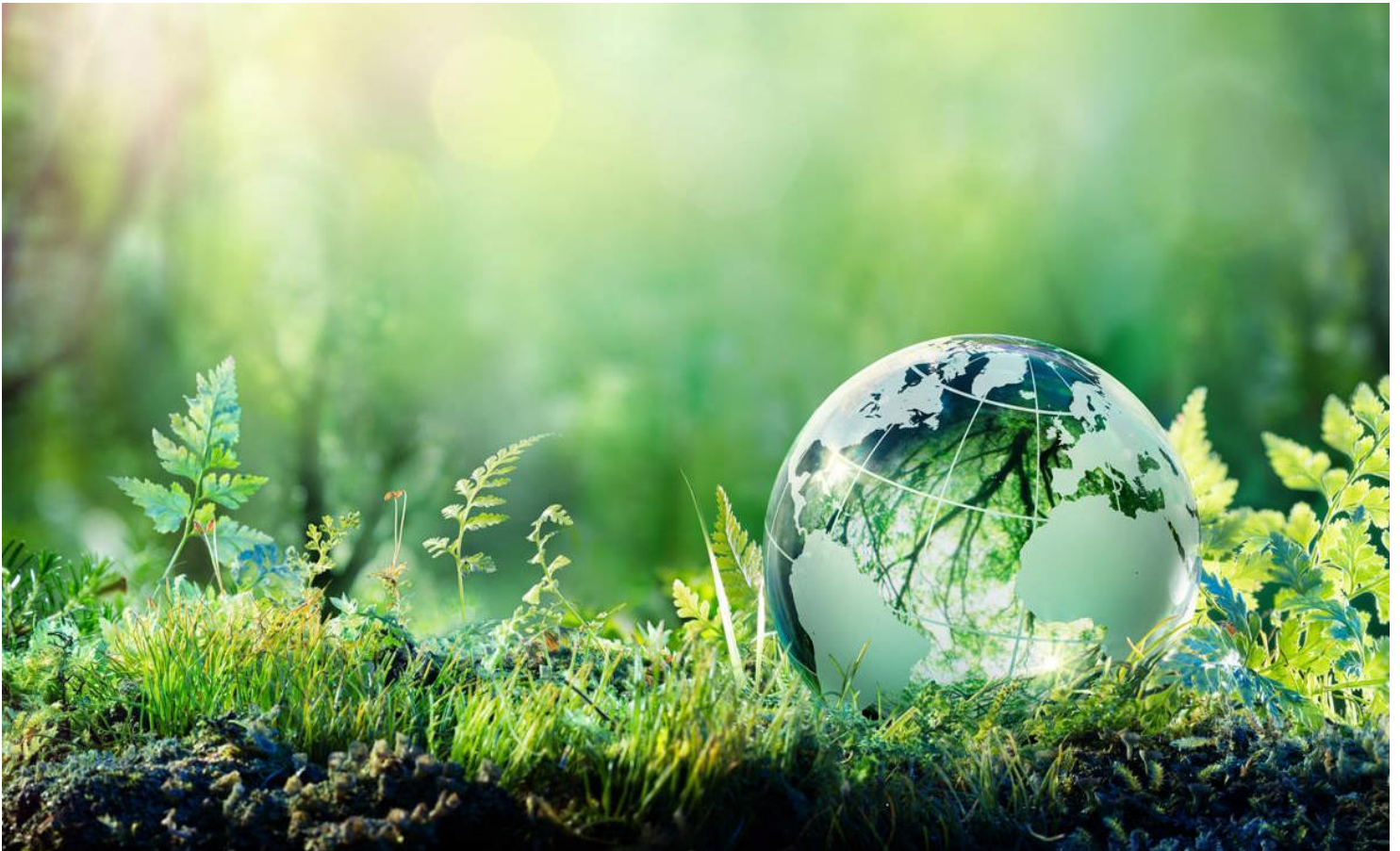
Below: Earth heals as carbon pollution falls.