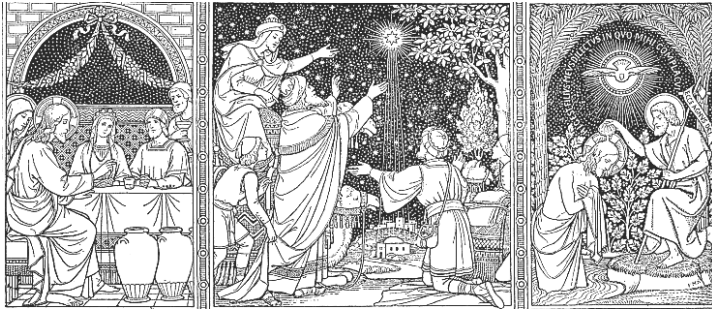
[ l-r: Wedding at Cana ✕ Epiphany of the Magi ✕ Baptism at the Jordan ]