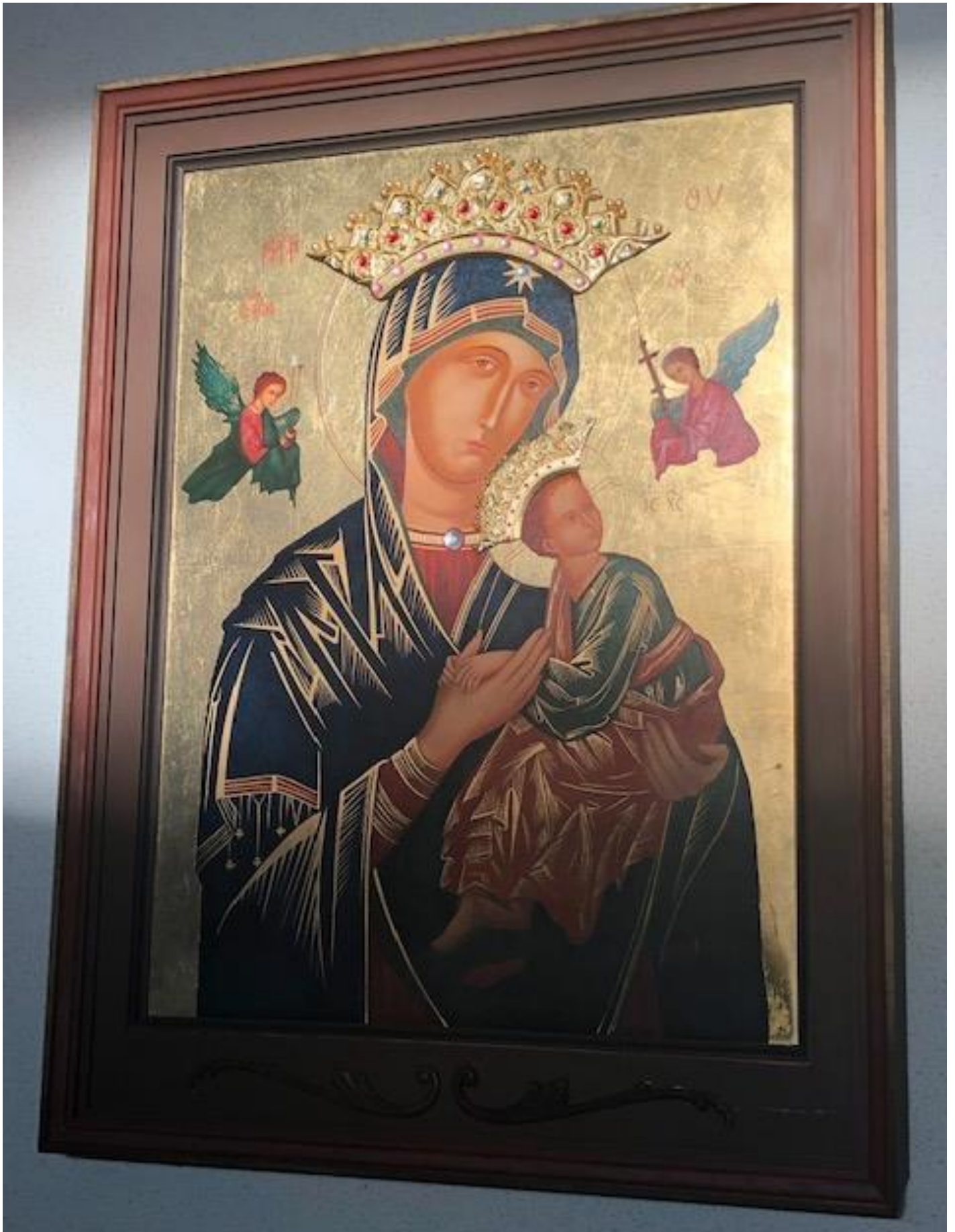
Our Mother of Perpetual Help, pray for us. Keep us close to your Son, our Saviour.