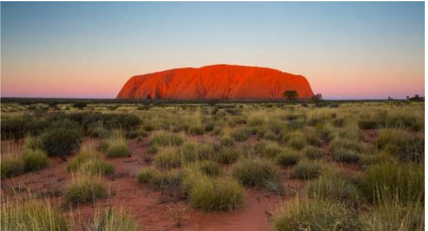
Below: Uluru Rock remains a solitary figure on the Australian horizon, in the midst of wild fires that have devastated the country.