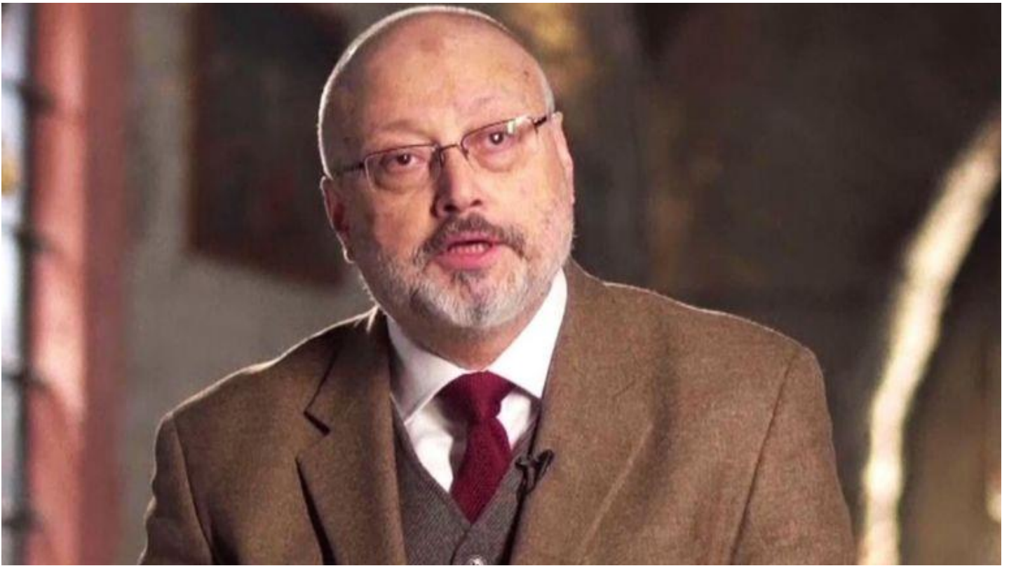
Above: Jamal Khashoggi, prior to his murder and dismemberment in the Saudi consulate in Istanbul, 2 October 2018.