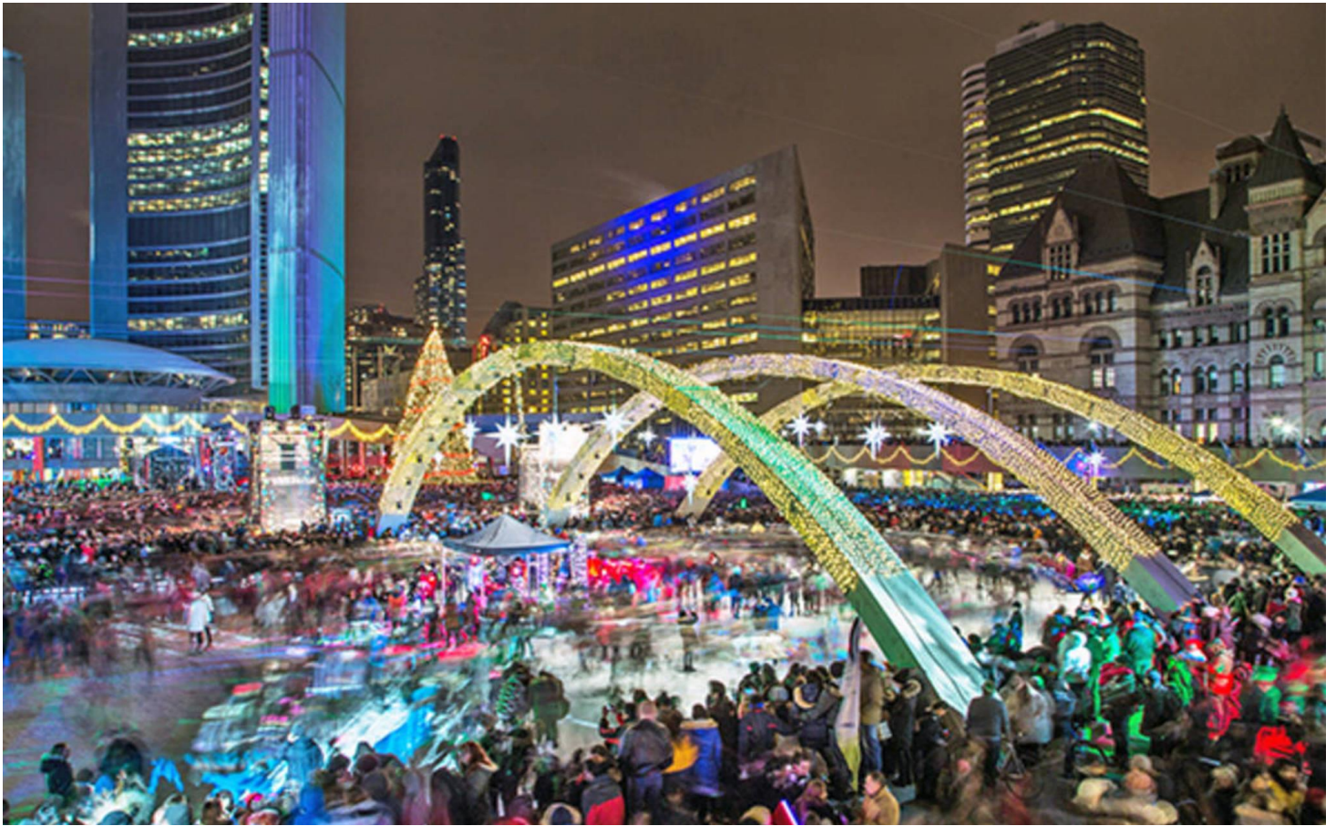
Above: Toronto: Nathan Philips Square.