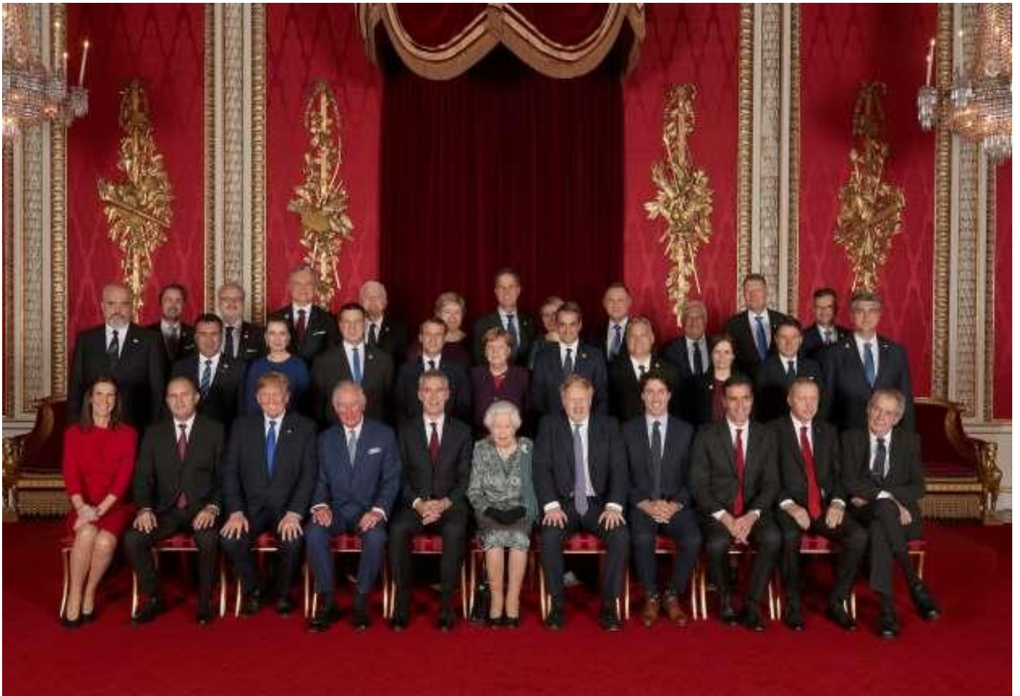
Below: NATO Summit members at Buckingham Palace, 3 December 2019.