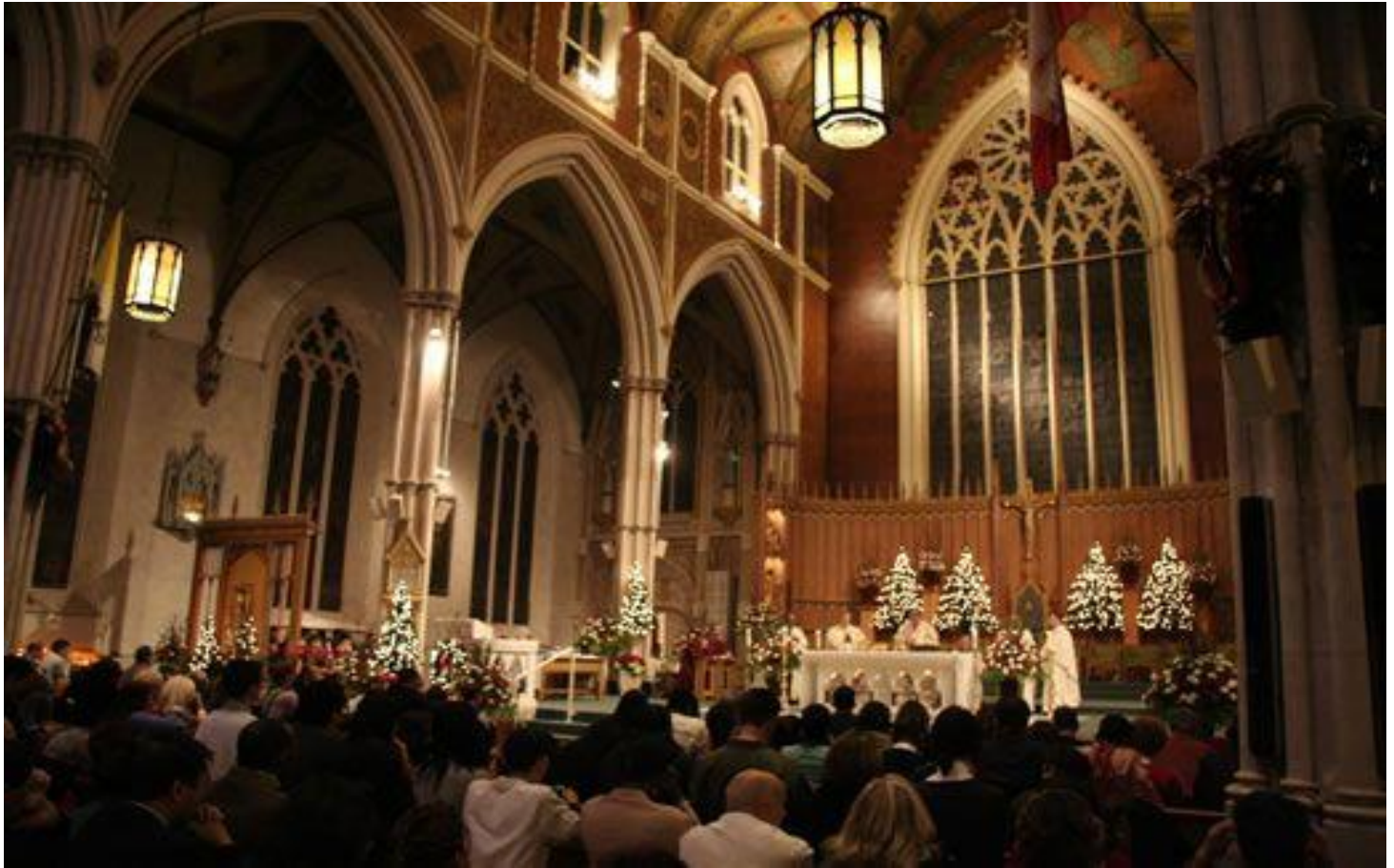
Below: Toronto: St. Michael Cathedral. Cathedral Photo