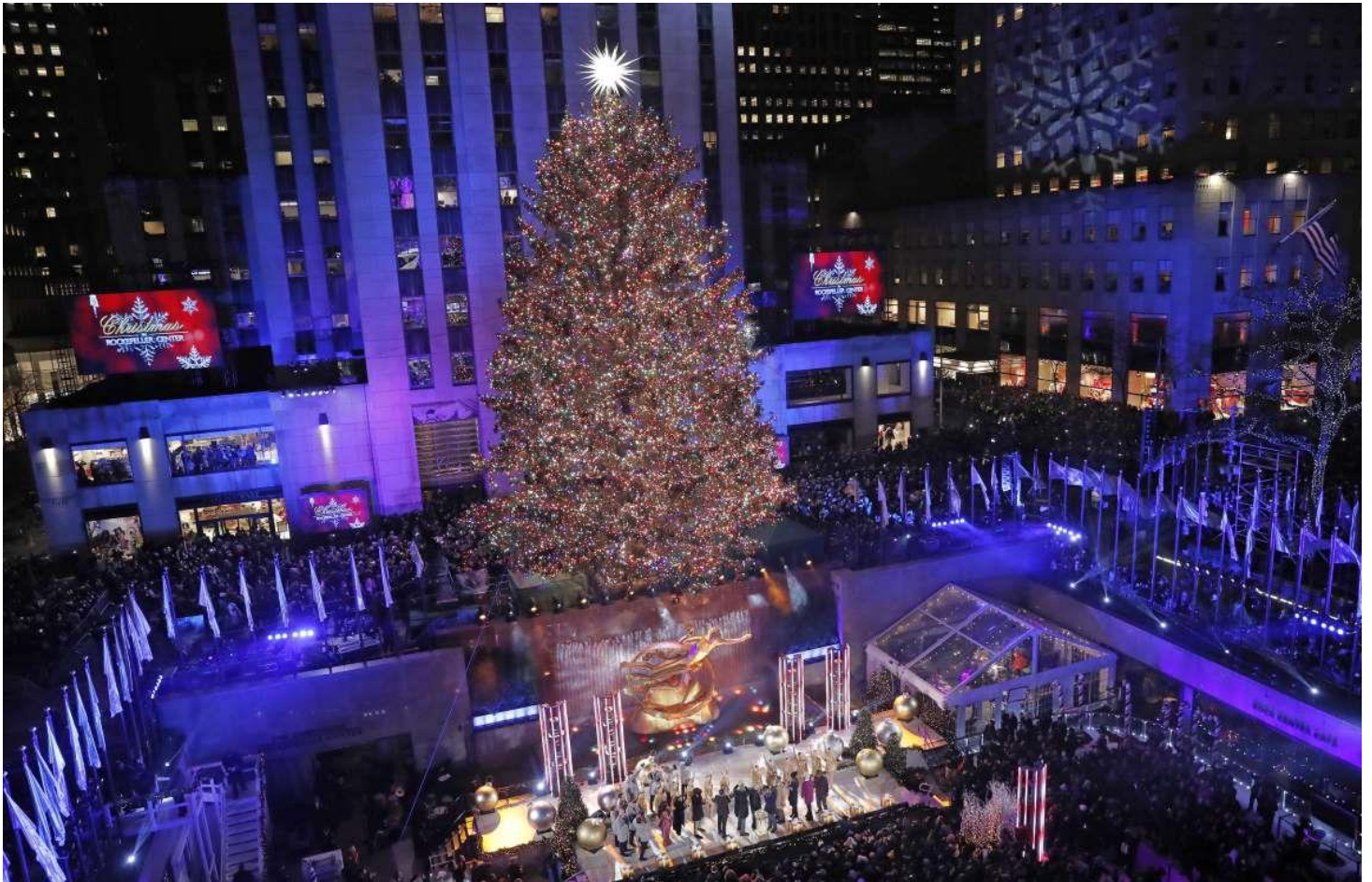
Below: New York: Rockefeller Center.