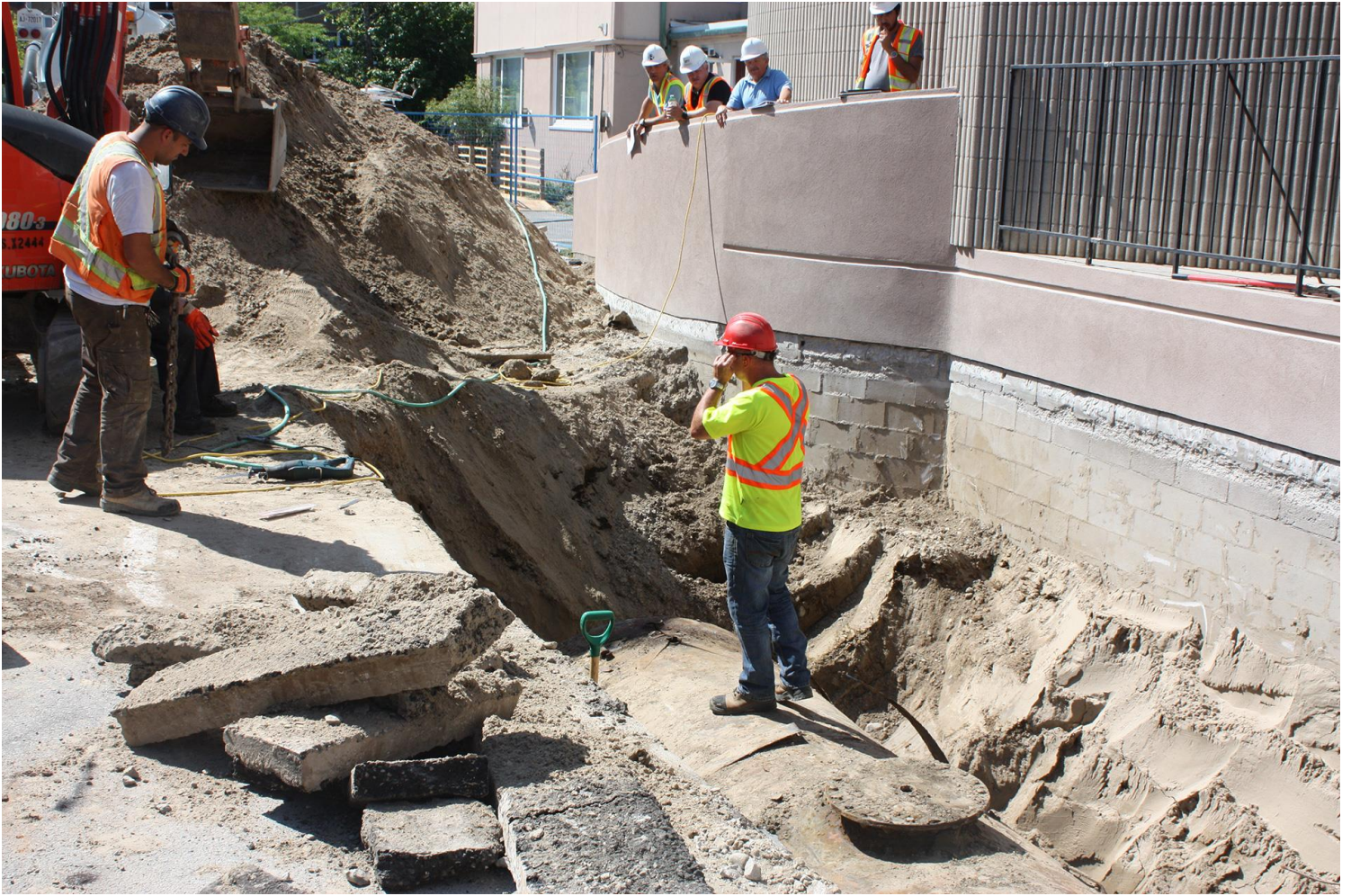
Removal of old oil storage tank.