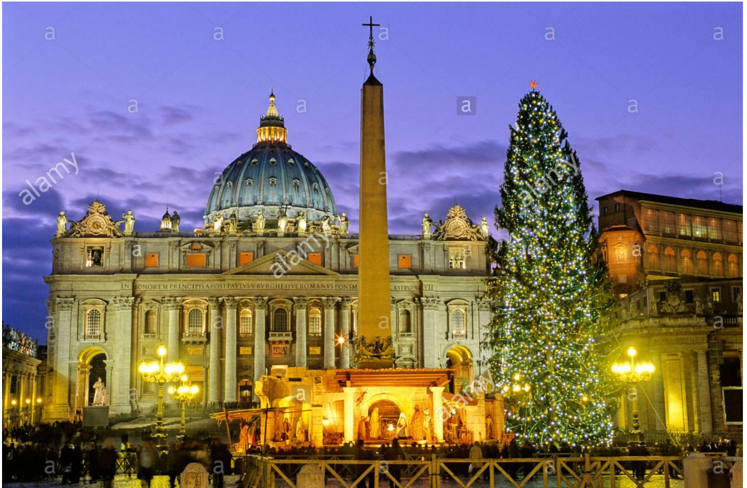
Above: Vatican City: St. Peter Square.