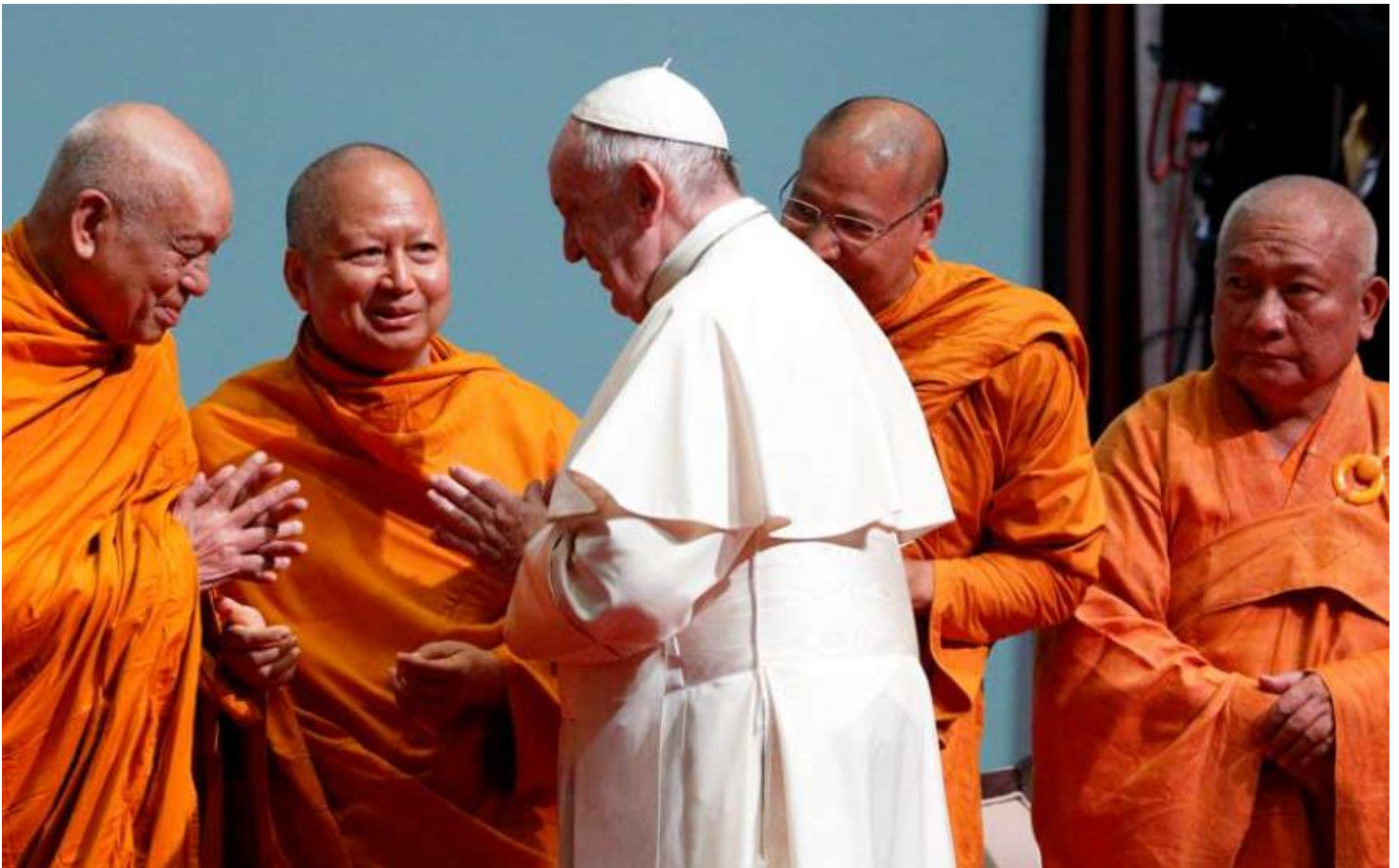
Above: Pope Francis greets religious leaders during a meeting with Christian leaders and the leaders of other religions at Chulalongkorn University in Bangkok, Thailand, 22 Nov. 2019.