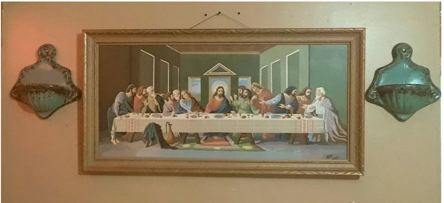
Below: The LAST SUPPER picture in the Byron family home represents our appreciation on the gift of the Eucharist, and its central role in our spiritual life.