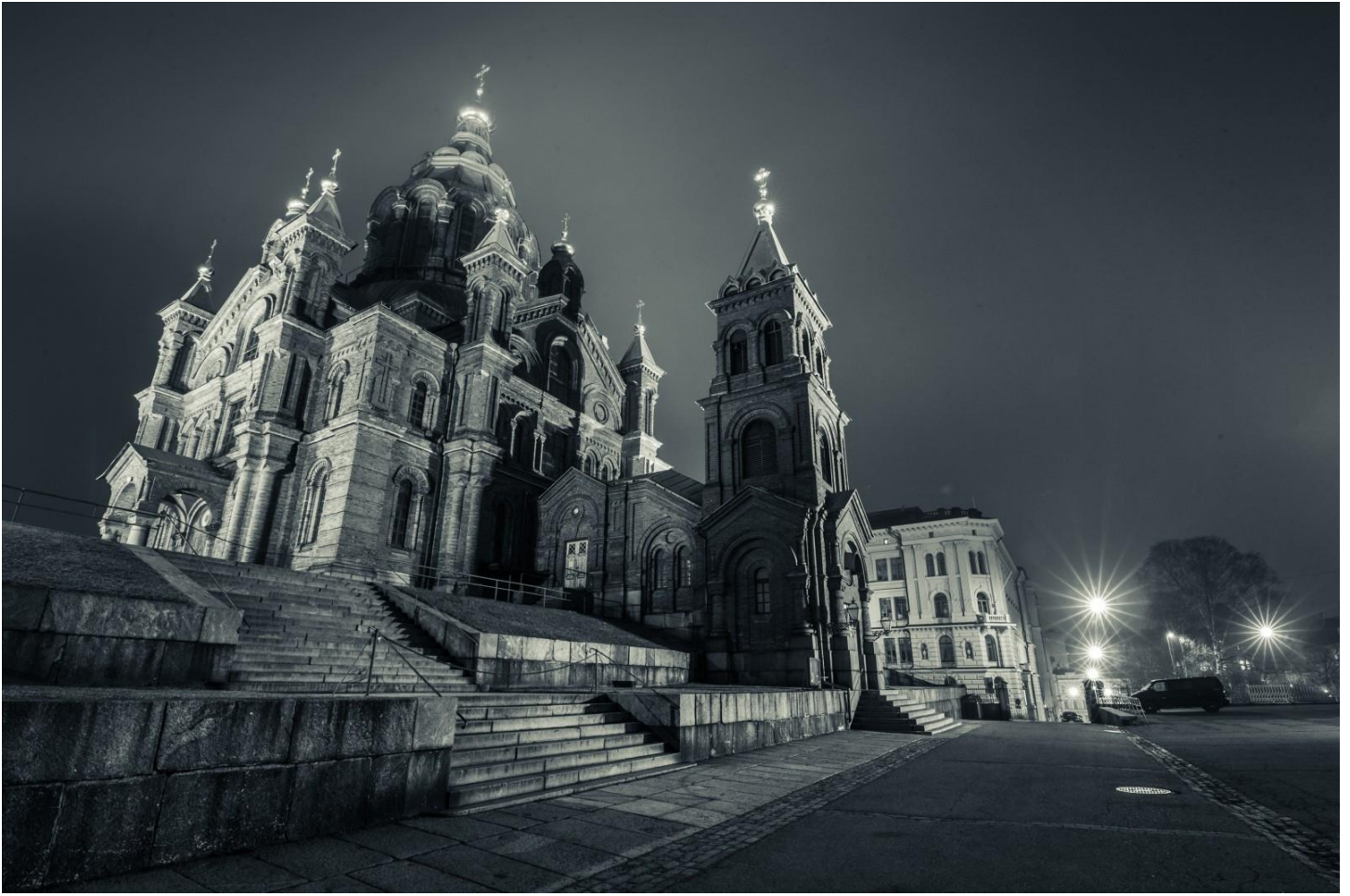
[Above] Cathedral, Helsinki, Finland.