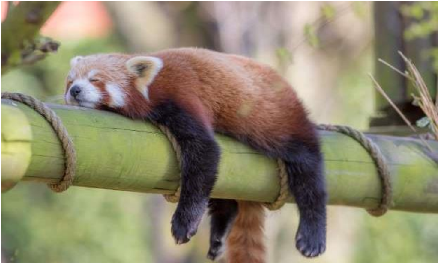
Above: Sleeping Red Panda; Below: Marmots.