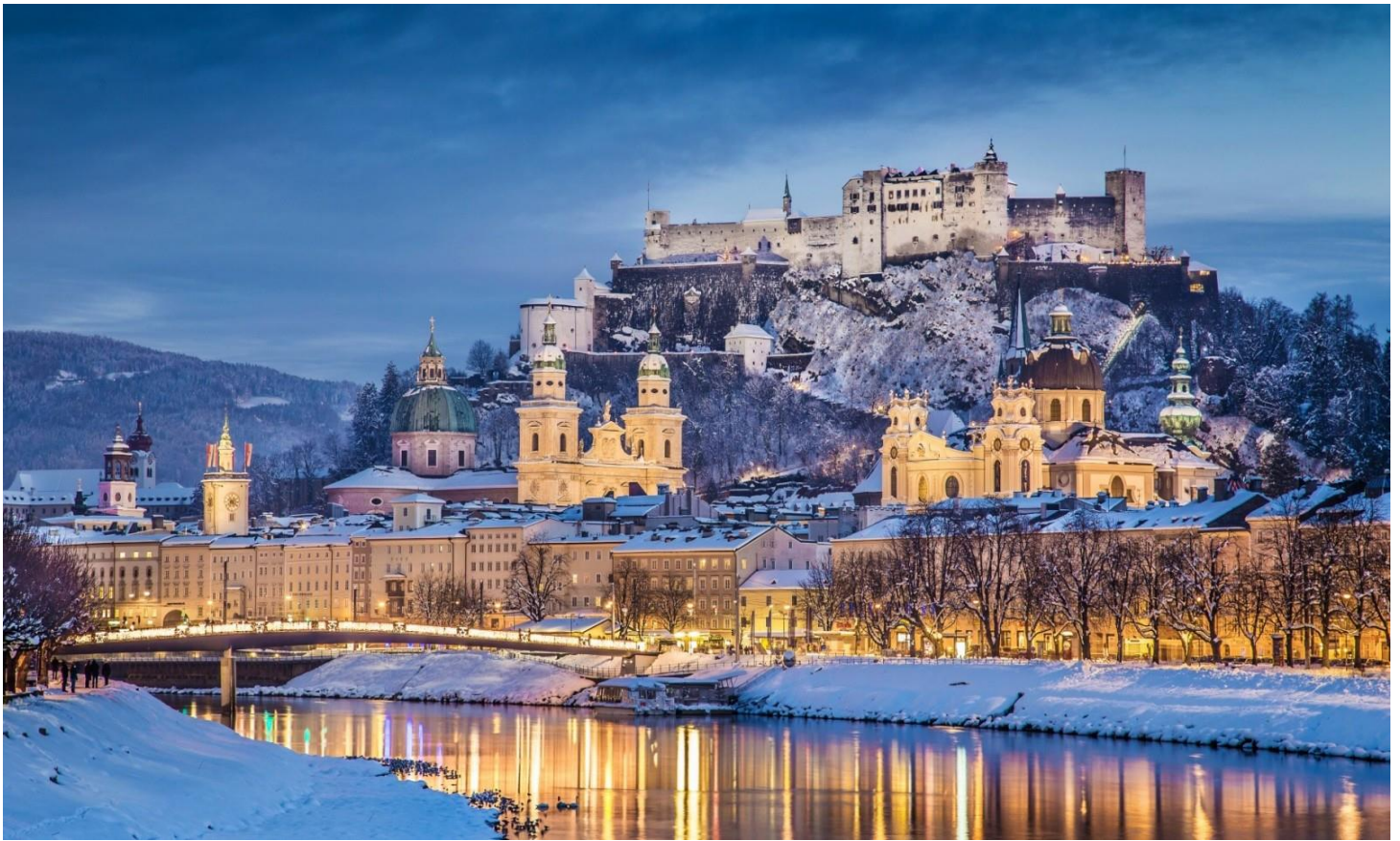
[Above] Salzburg, Austria.