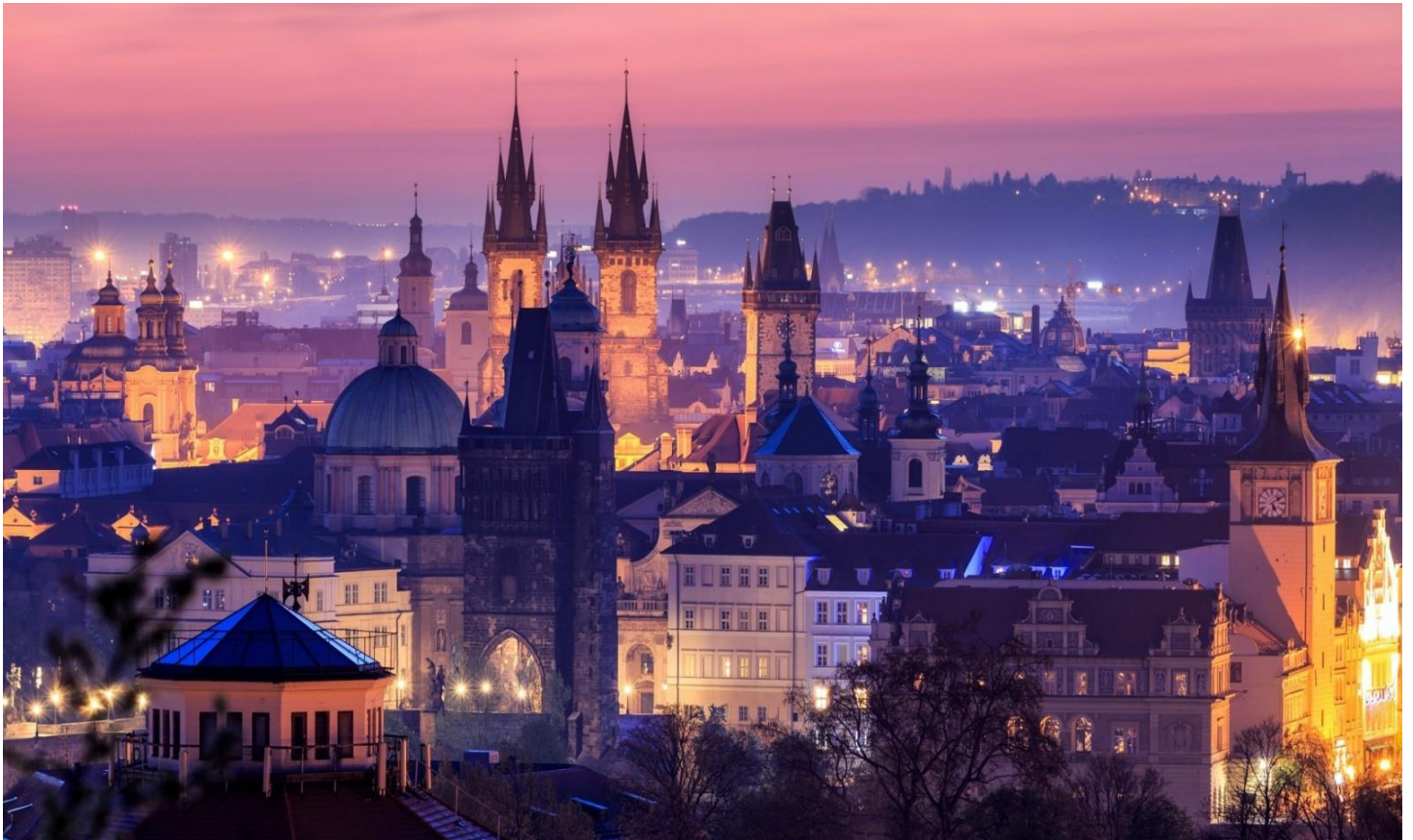
[Below] Old Town, Prague, Czechia.