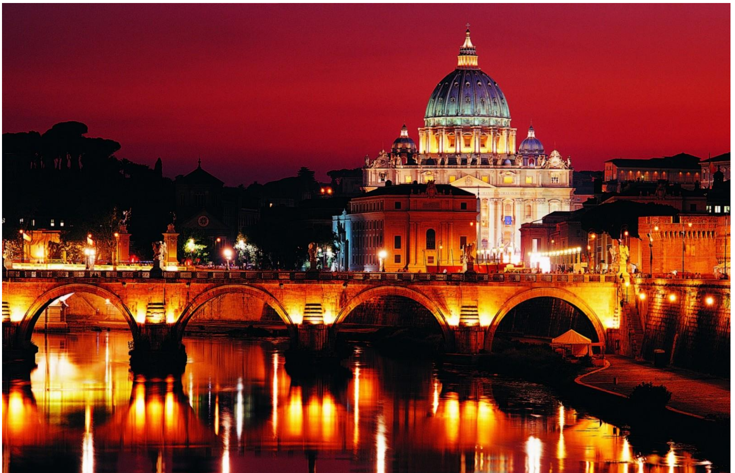
[Below] St. Peter Basilica from Tiber River, Rome.