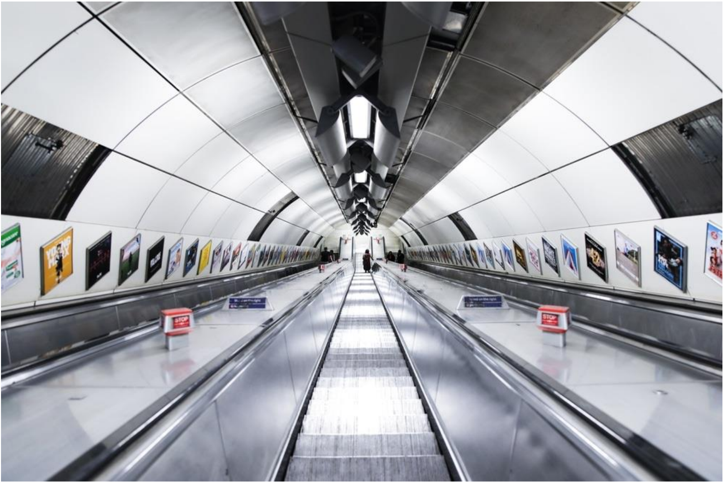
[Above] Escalator in London Underground