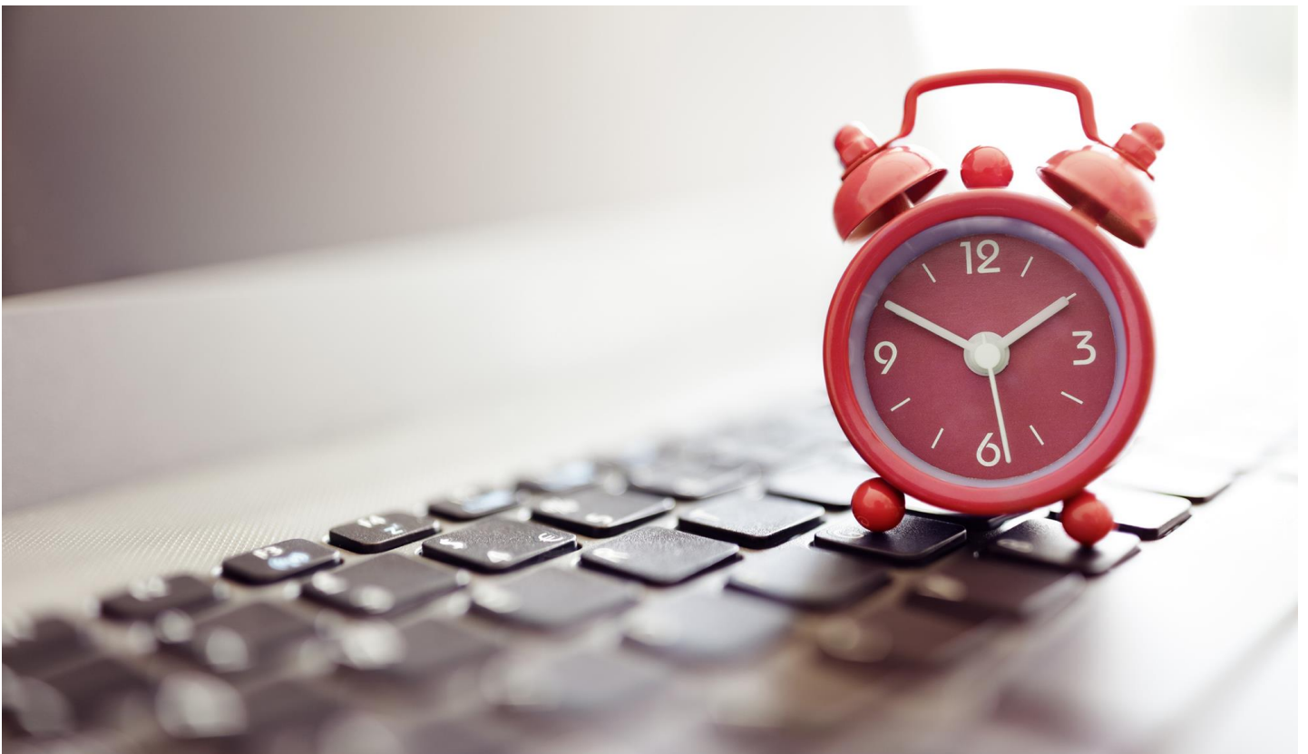
[Below] Time is short. Vita Brevis, Memento Mori.