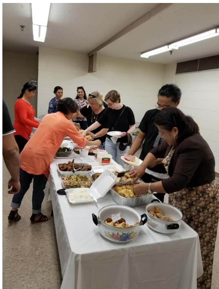
Lectors' Social, 21 September 2019