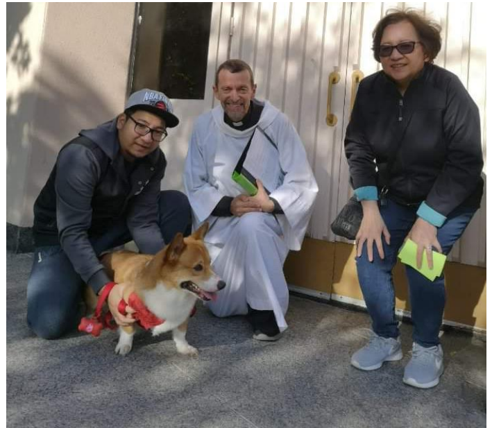
[Above] Chopper the Corgi with his family at the annual BLESSING OF ANIMALS on Saturday, 5 October.