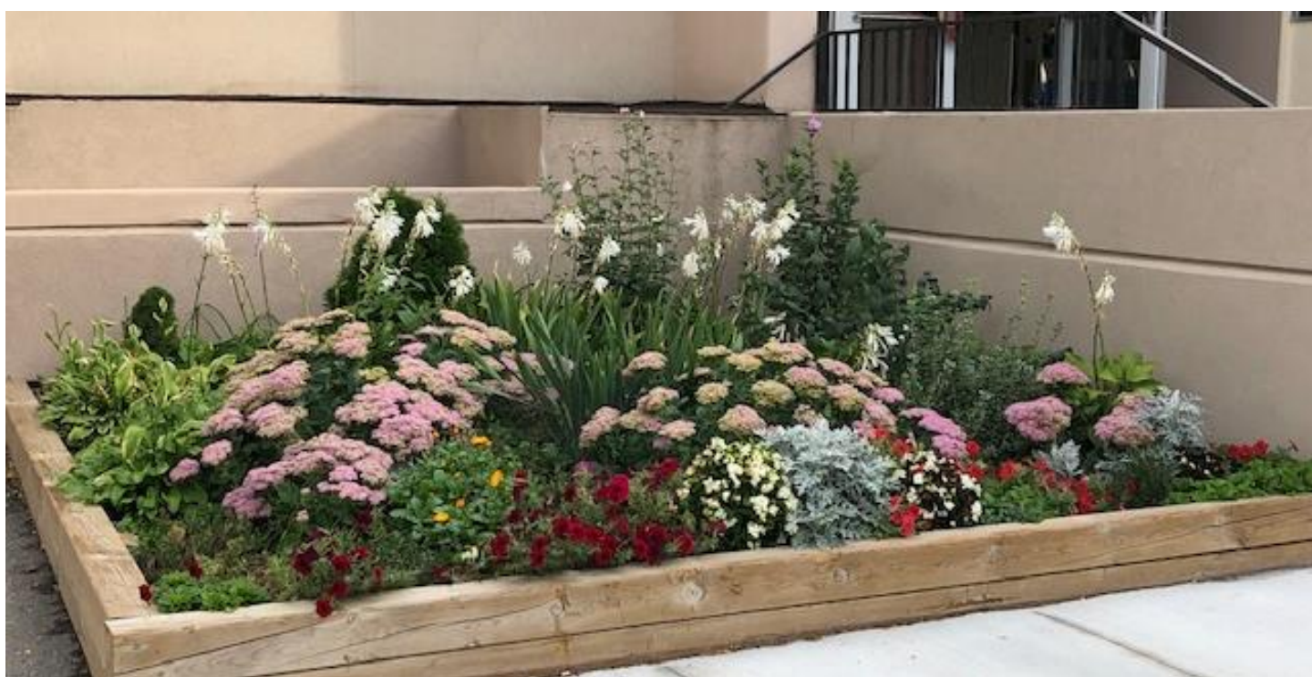
Flowers inside and out, October 2019