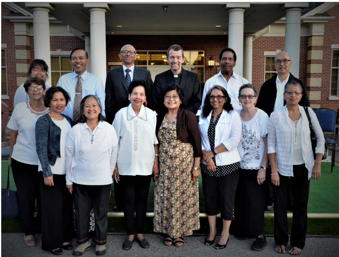
Annual Catholic Cemetery Mass 14 August 2019