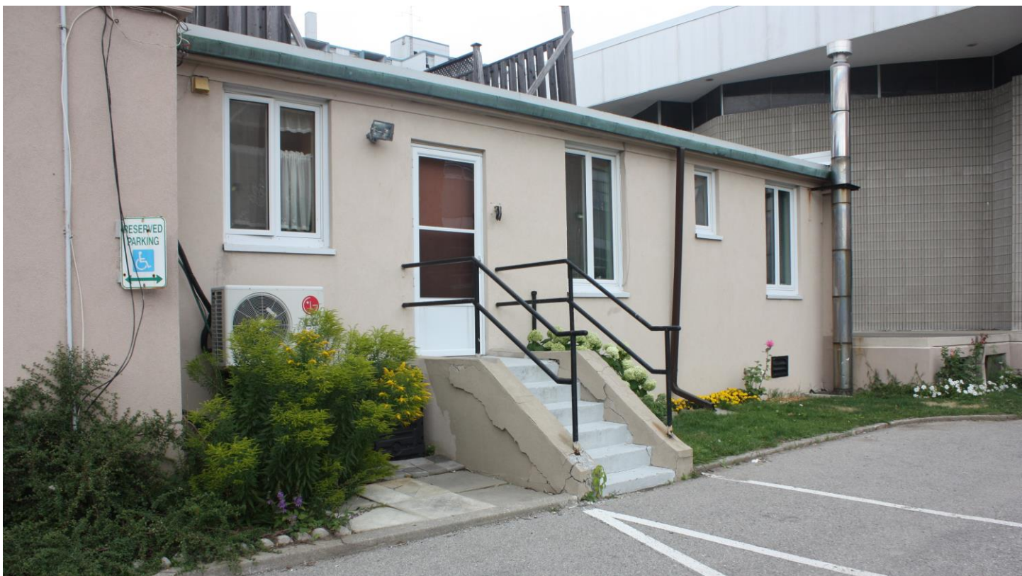
Repair & Renewal Scenes from projects in recent years.

A vicious wind storm damaged the rectory deck, and water infiltration required a major reconstruction of the peripheral drainage system. The bright shoes on the terrace belong to Ezekiel Carpio, the photographer's son.