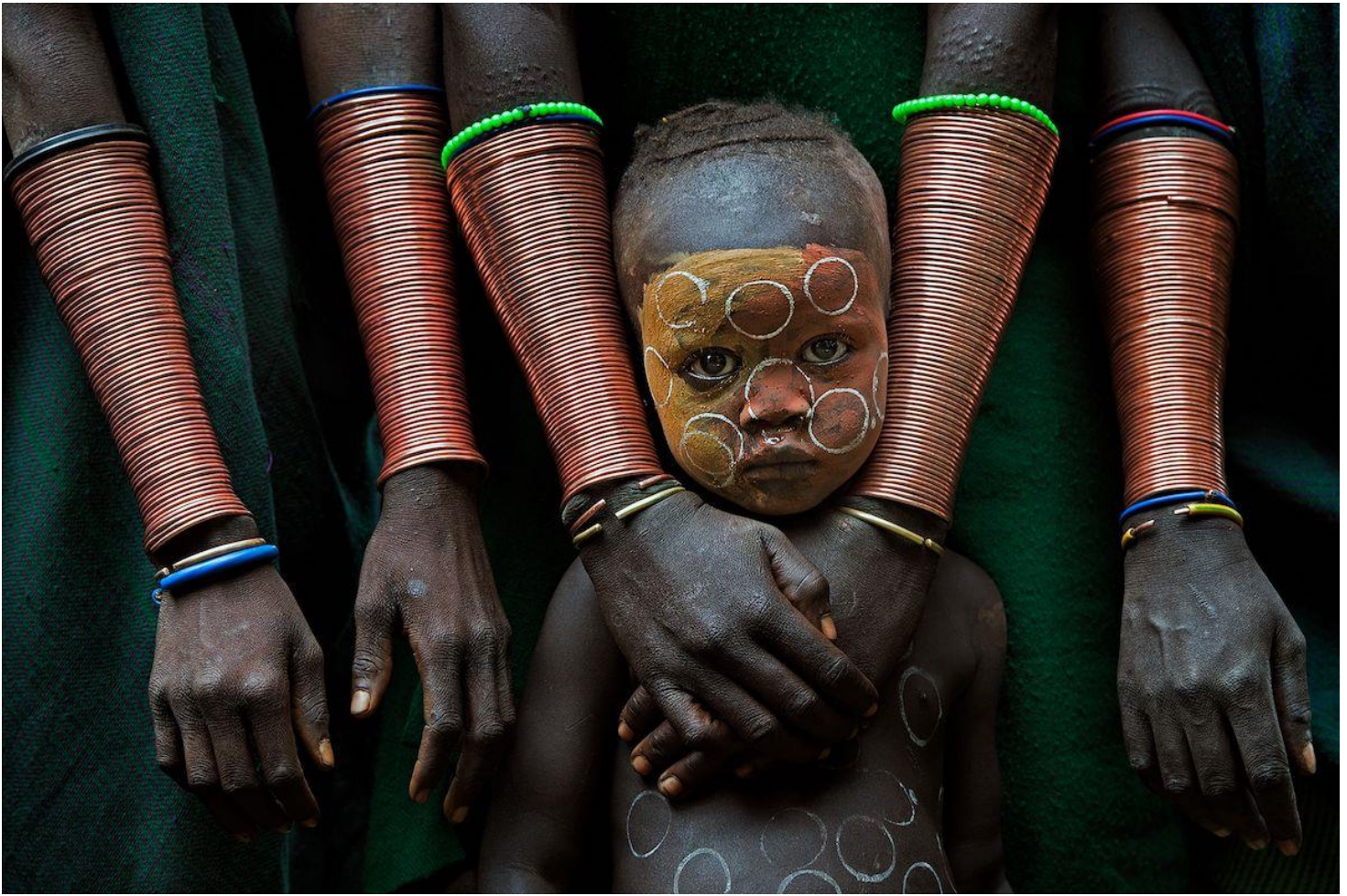
[Above: A child of the Suri tribe, Indonesia.]