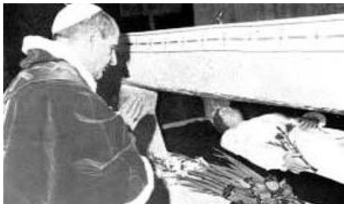
[ Below: Pope Paul VI prays at the casket of St. Maria Goretti in Nettuno, Italy ]