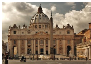
[ Left : St. Peter Basilica, Vatican City;

In the name of the Father, and of the Son, and of the Holy Spirit. Amen.