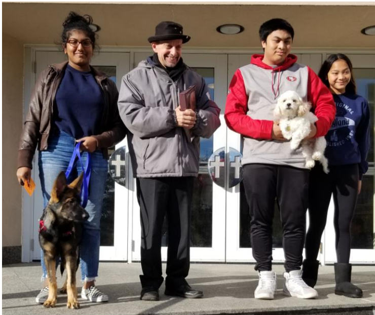
[Photo: Some of the participants in the annual BLESSING OF ANIMALS, held this year on Saturday, 13 October.]