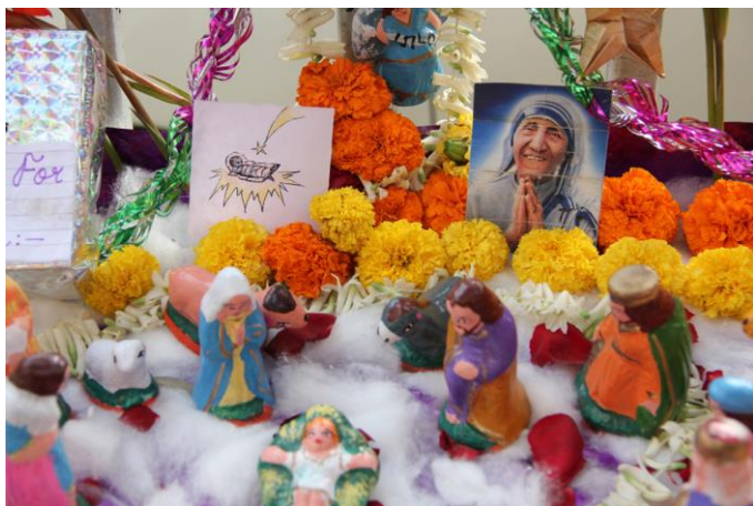
Sidewalk tributes to Mother Teresa outside the Sisters' convent, Kolkata.