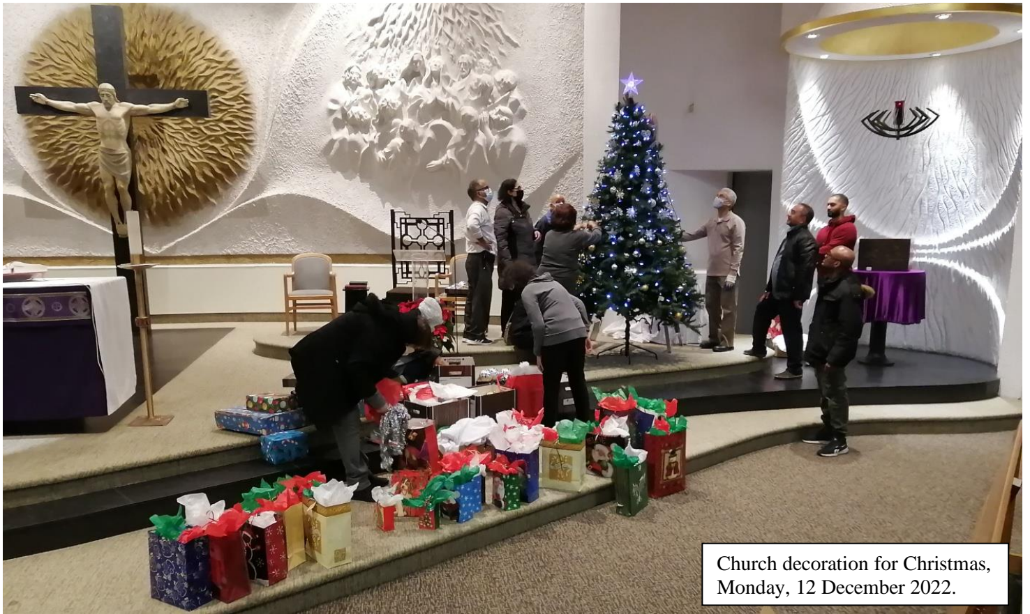
Church decoration for Christmas, Monday, 12 December 2022.