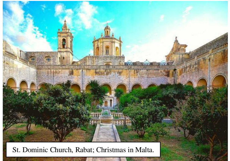
St. Dominic Church, Rabat; Christmas in Malta.

Mass praesente cadavere was offered on 11 December at St Dominic Church, Rabat, Malta, followed by burial at St Margherita Cemetery. ✠ May God grant him eternal rest. ✠