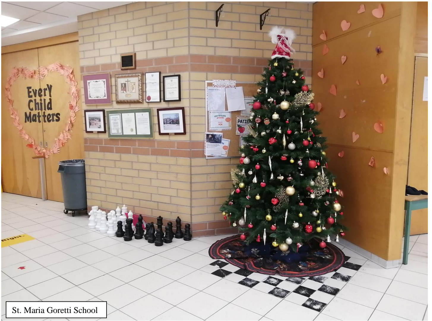
St. Maria Goretti School