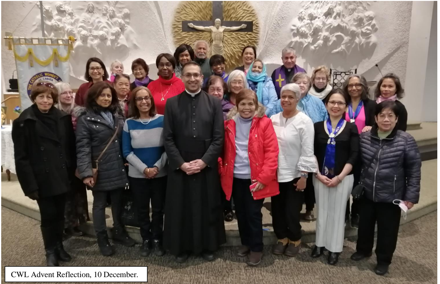
CWL Advent Reflection, 10 December.