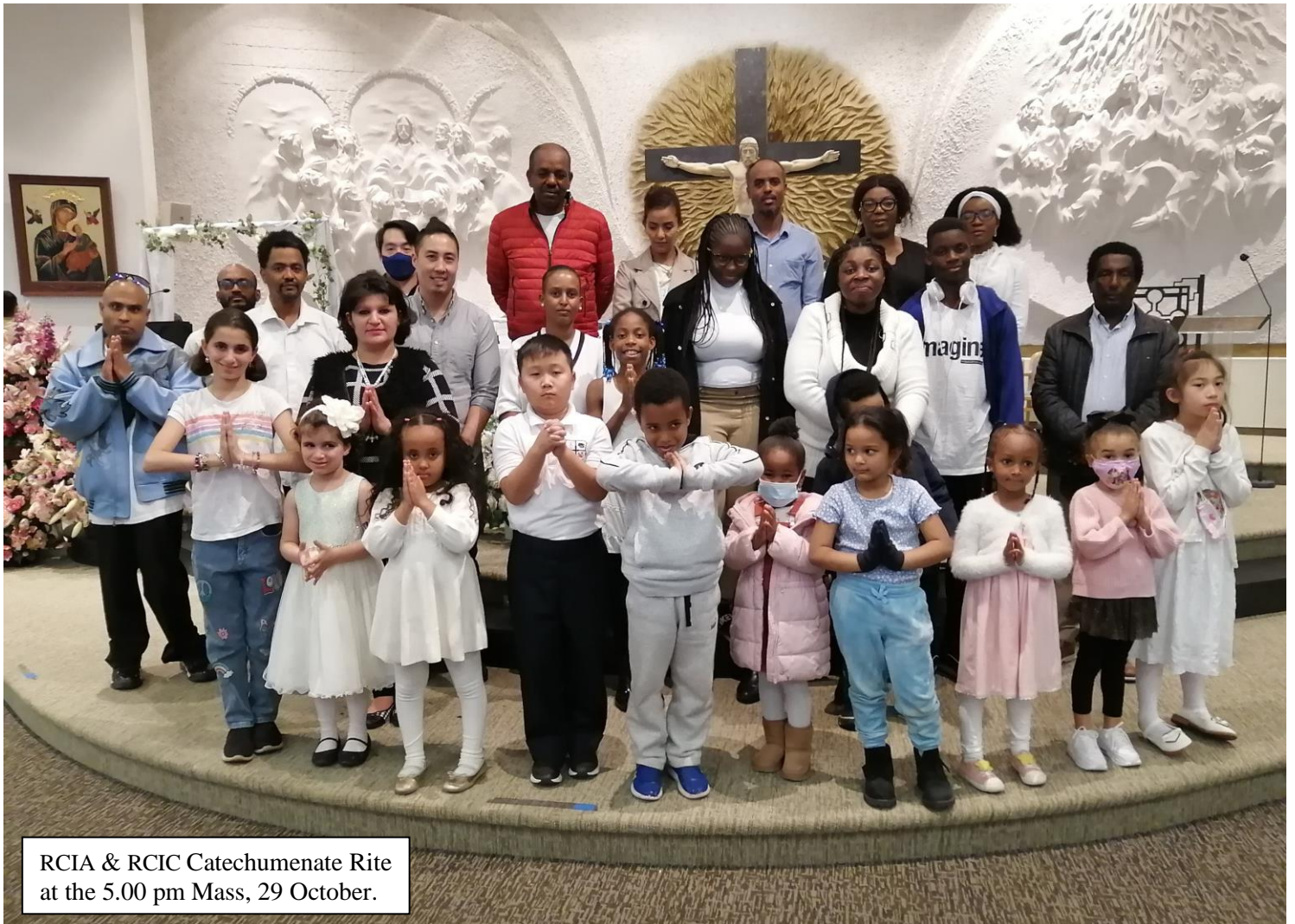
RCIA & RCIC Catechumenate Rite at the 5.00 pm Mass, 29 October.