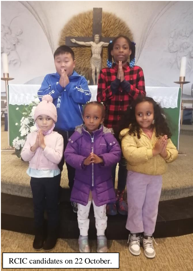
RCIC candidates on 22 October.