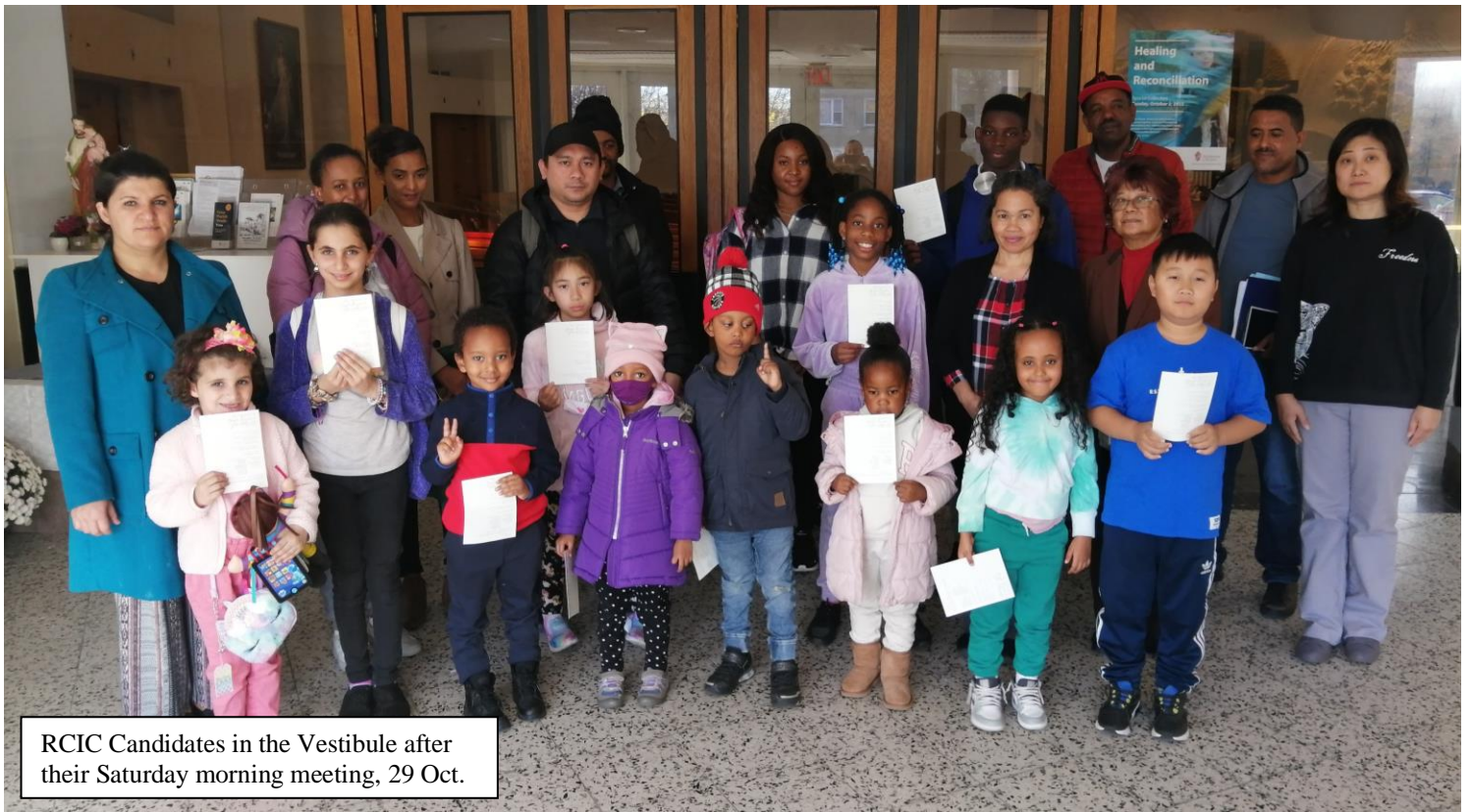
RCIC Candidates in the Vestibule after their Saturday morning meeting, 29 Oct.