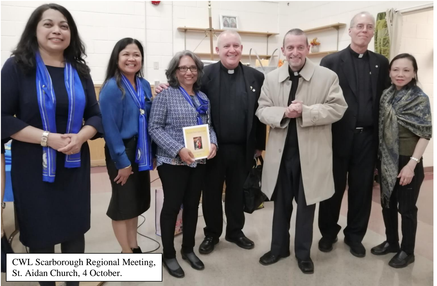
CWL Scarborough Regional Meeting, St. Aidan Church, 4 October.