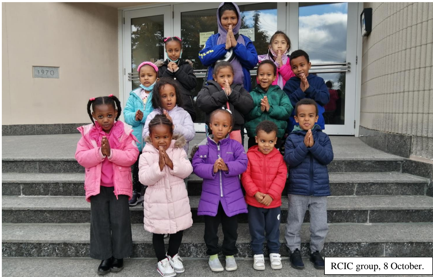
RCIC group, 8 October.