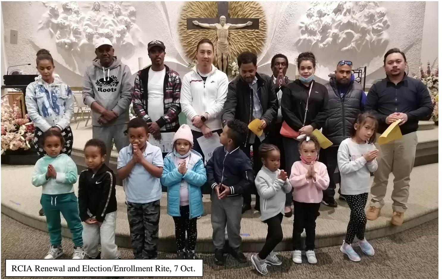
RCIA Renewal and Election/Enrollment Rite, 7 Oct.