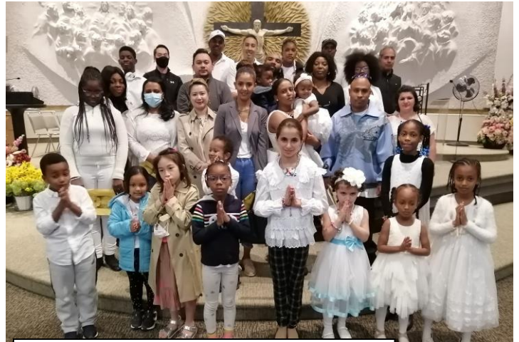
RCIA Rite of Candidacy, 24 September.