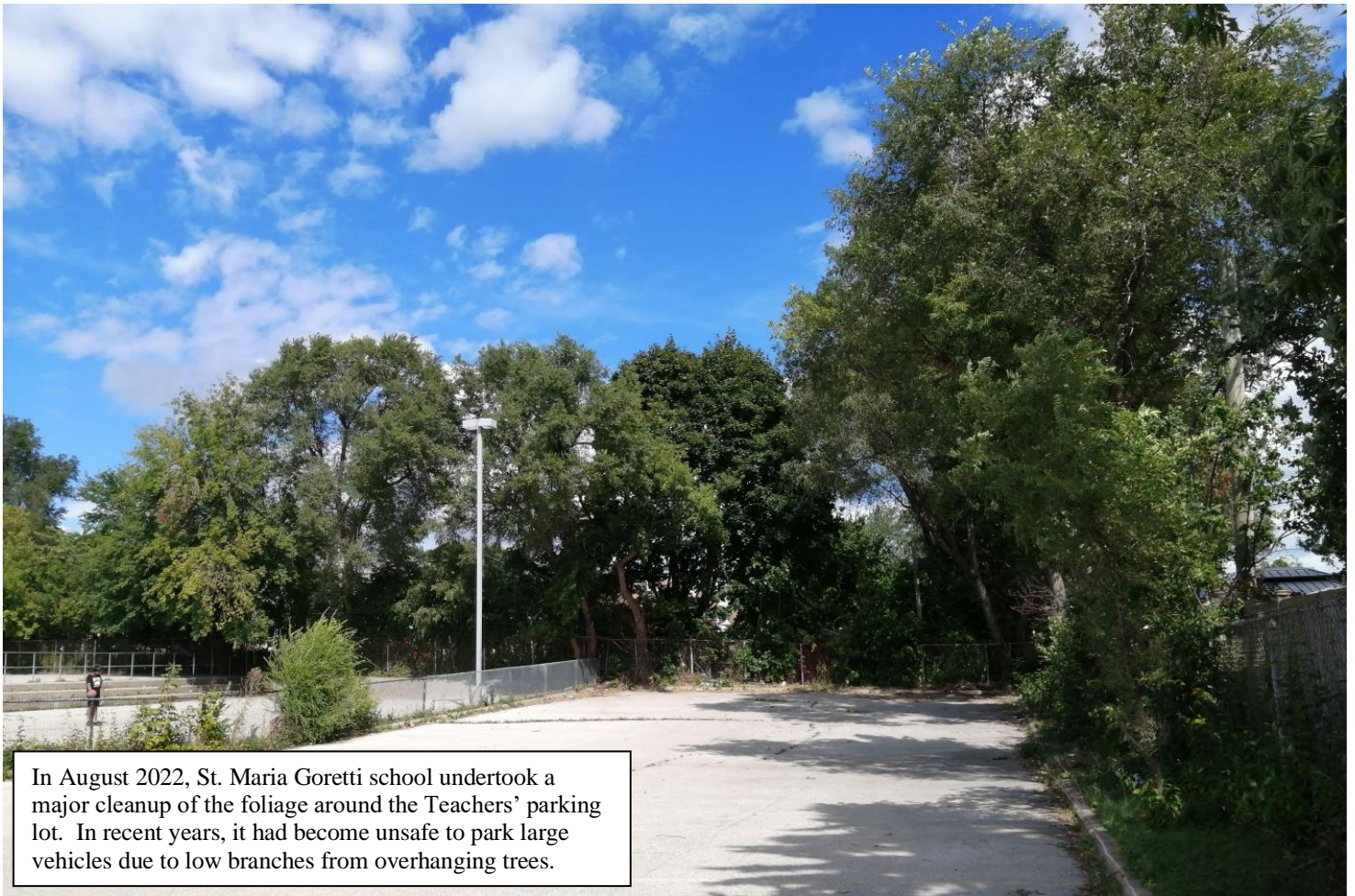
In August 2022, St. Maria Goretti school undertook a major cleanup of the foliage around the Teachers' parking lot. In recent years, it had become unsafe to park large vehicles due to low branches from overhanging trees.