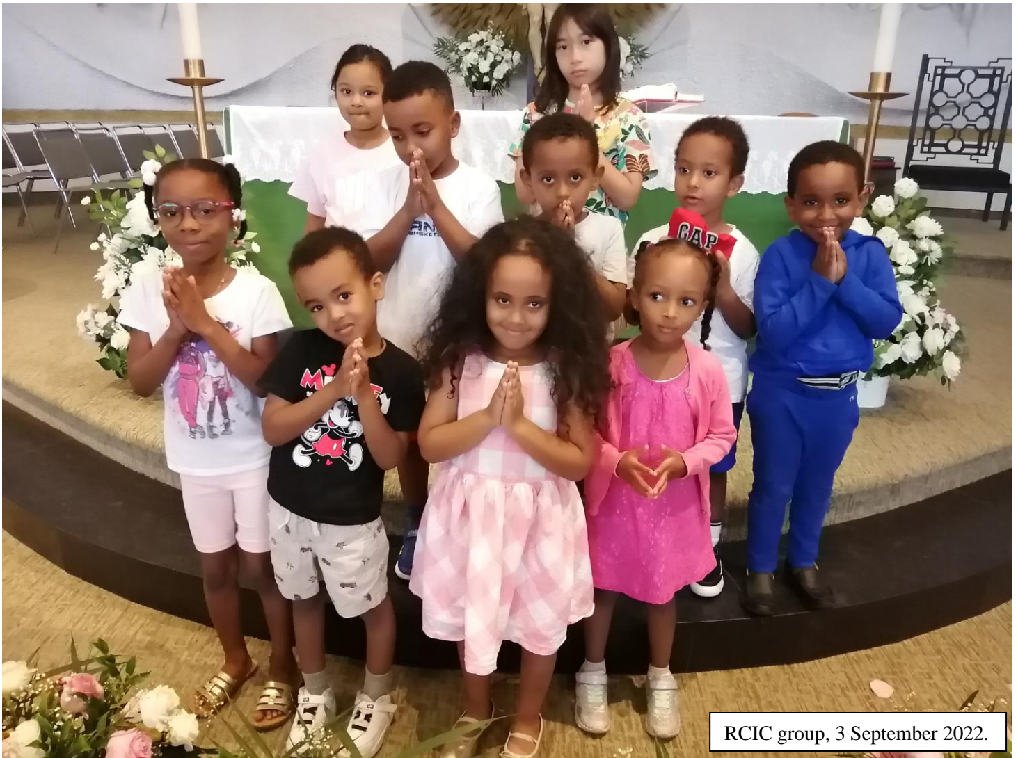
RCIC group, 3 September 2022.