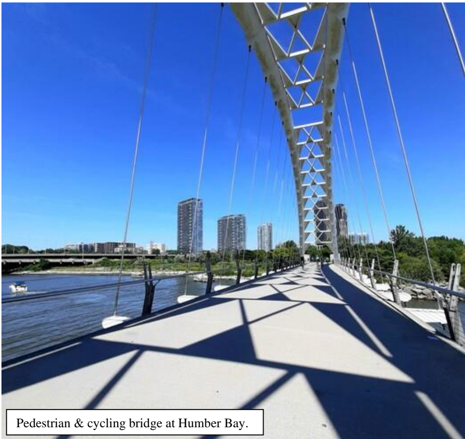
Pedestrian & cycling bridge at Humber Bay.