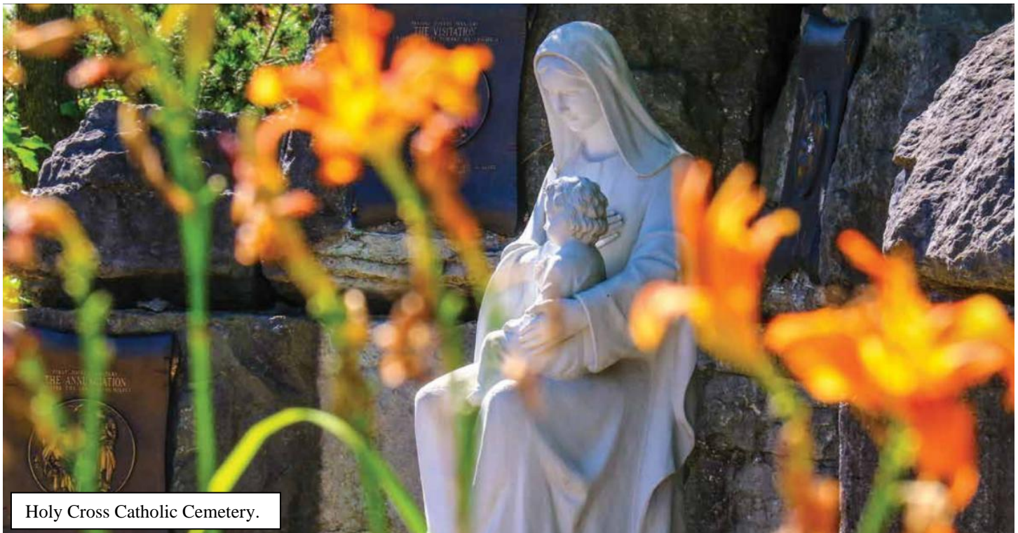
Holy Cross Catholic Cemetery.