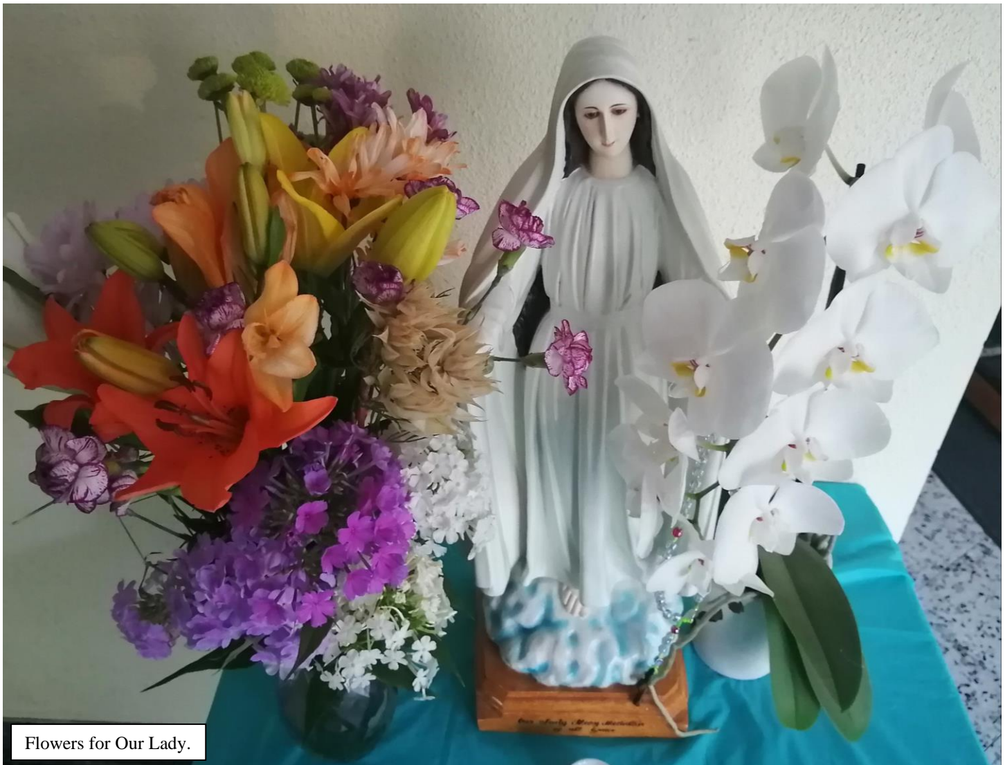
Flowers for Our Lady.