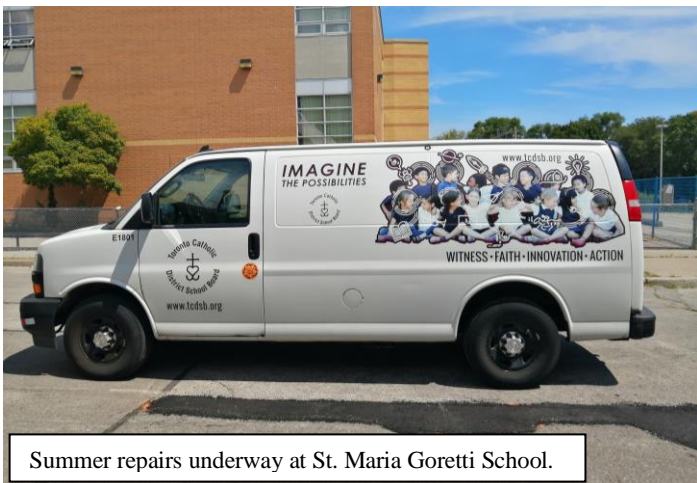
Summer repairs underway at St. Maria Goretti School.

Every Summer, the catch basins in the parking lot and school laneway must be cleaned out with high-powered suction hoses. This is necessary to ensure the optimal performance of the basins, particularly in view of the increasing frequency of very intense rainstorms with record-breaking precipitation. Basins that are clogged with debris can pose a significant hazard to nearby properties in the case of major rain events.