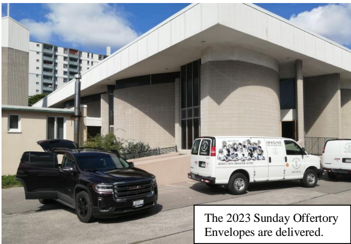
The 2023 Sunday Offertory Envelopes are delivered.