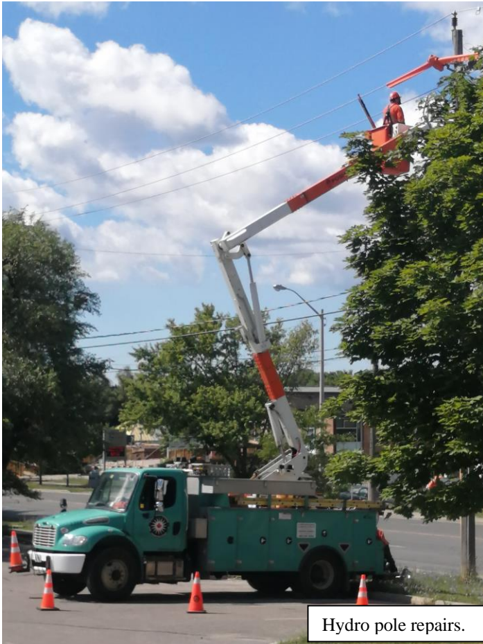
Hydro pole repairs.