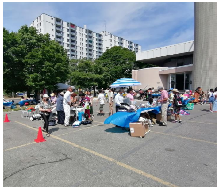
Photos from Parish Bazaar, 17 July.