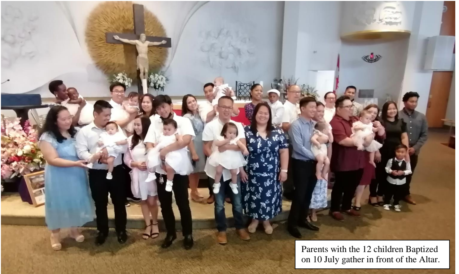
Parents with the 12 children Baptized on 10 July gather in front of the Altar.