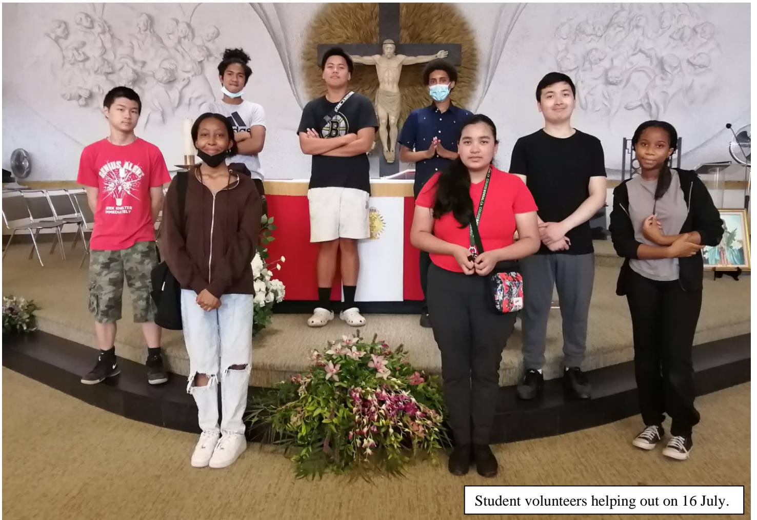
Student volunteers helping out on 16 July.