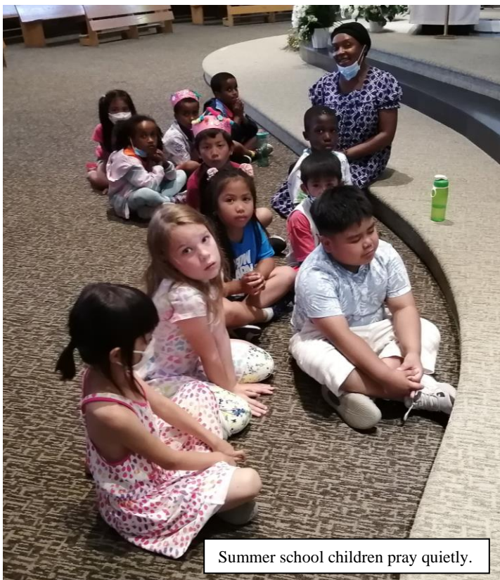
Summer school children pray quietly.