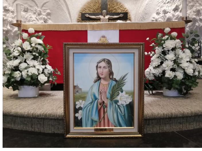
This traditional image of our dear Patroness will be installed in our Sanctuary at the first Mass on our Parish Feast Day weekend: 5 pm on 2 July 2022. It will be carried in procession by the Greeters.