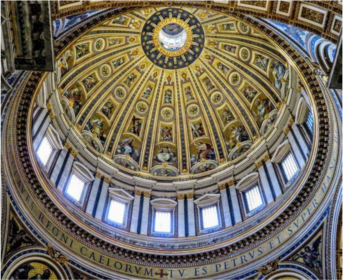
St. Peter Dome, Vatican