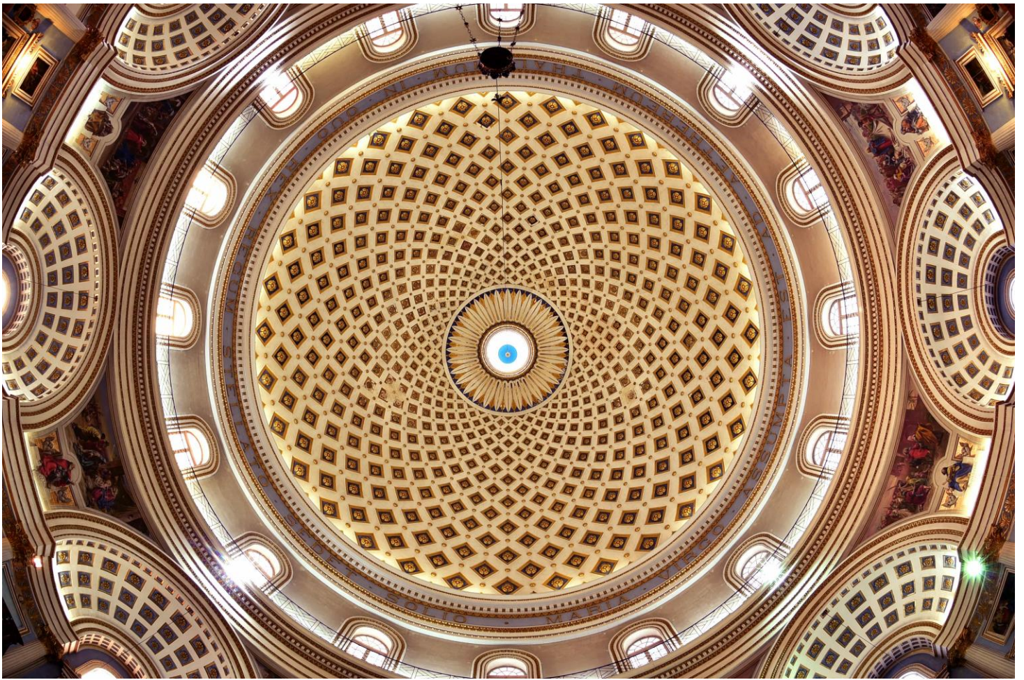
Mosta Dome, Malta