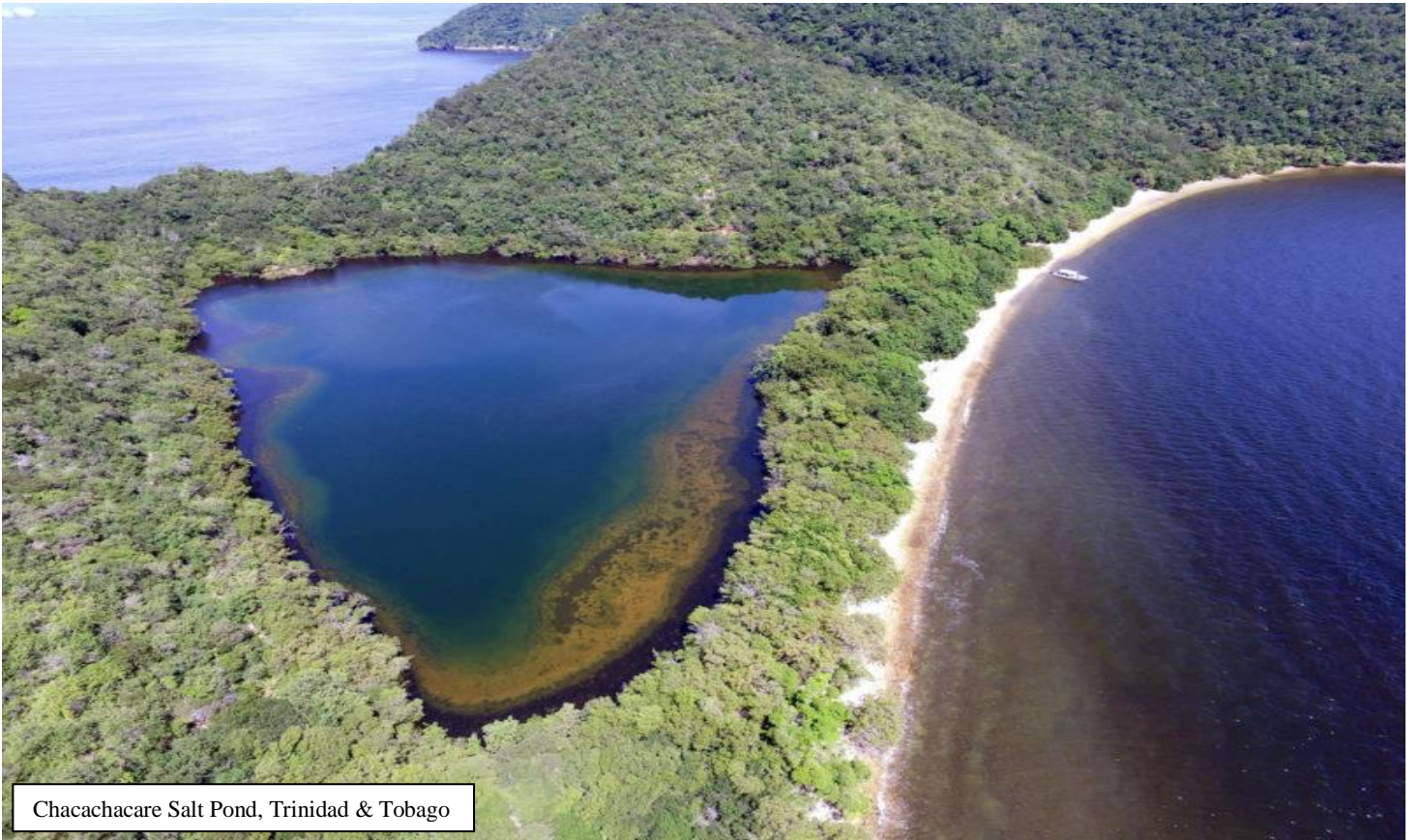
Chacachacare Salt Pond, Trinidad & Tobago