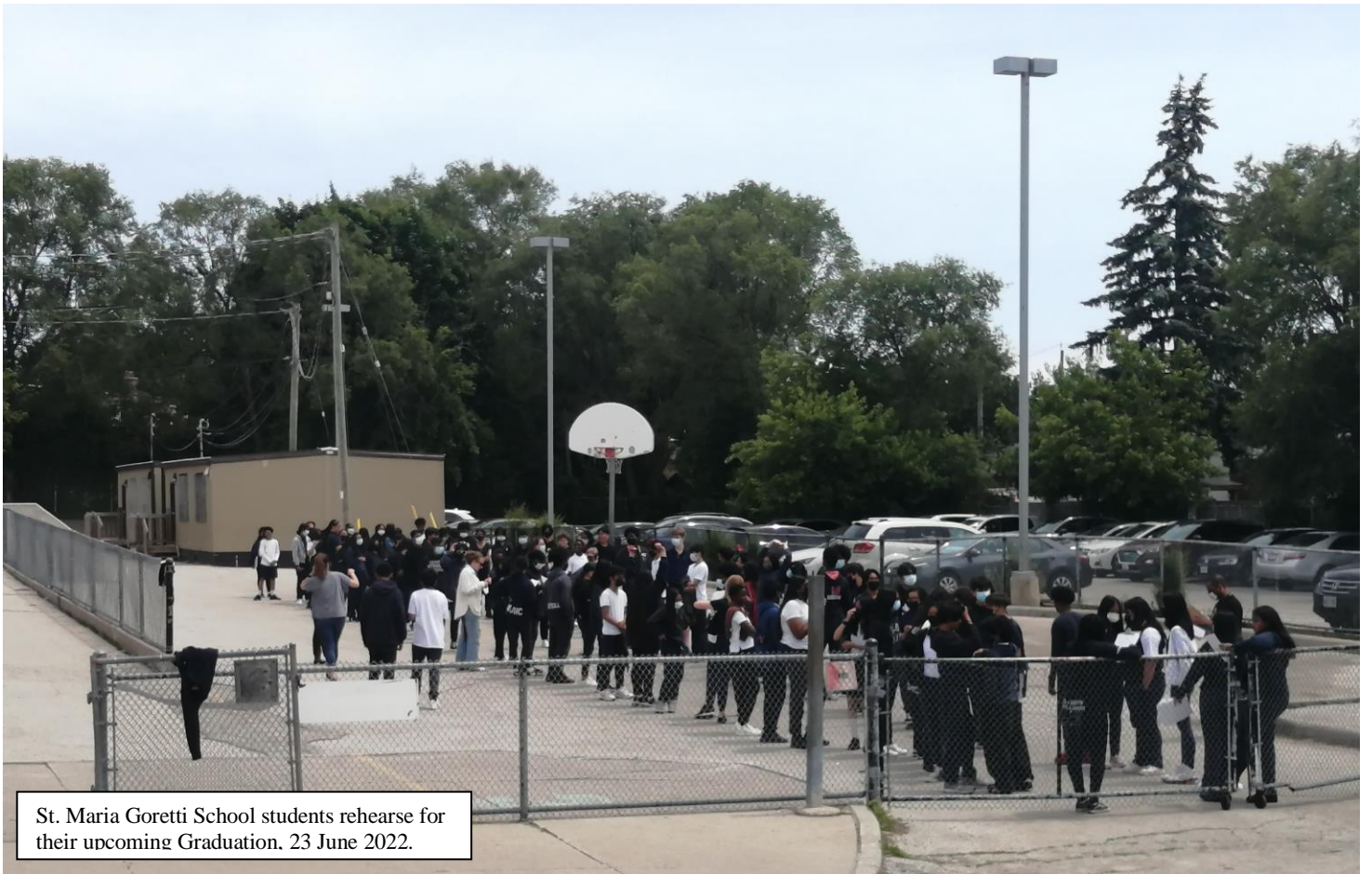
St. Maria Goretti School students rehearse for their upcoming Graduation, 23 June 2022.