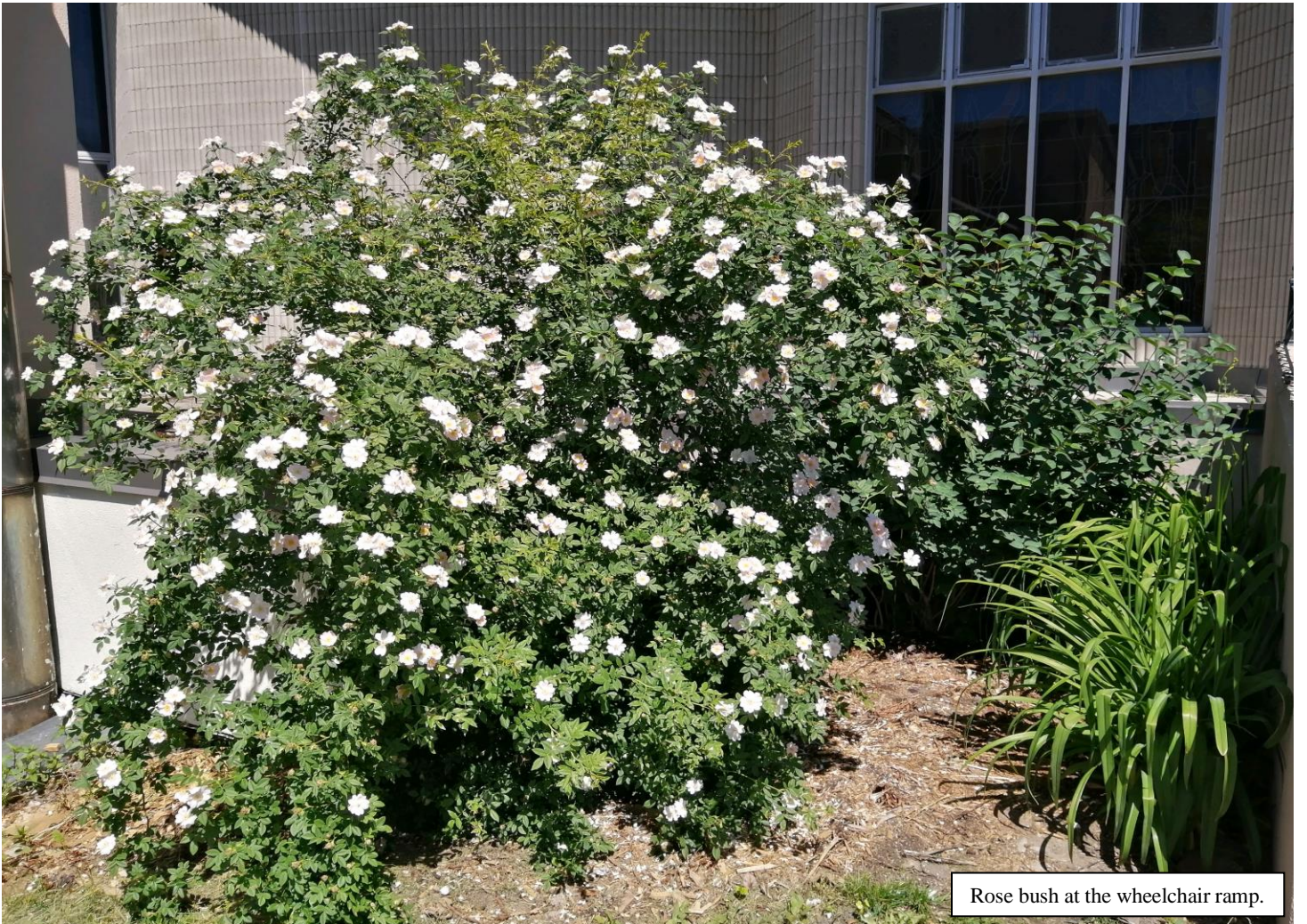
Rose bush at the wheelchair ramp.