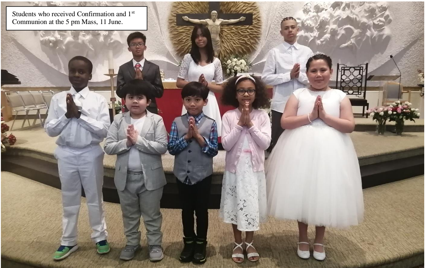
Students who received Confirmation and 1 st Communion at the 5 pm Mass, 11 June.