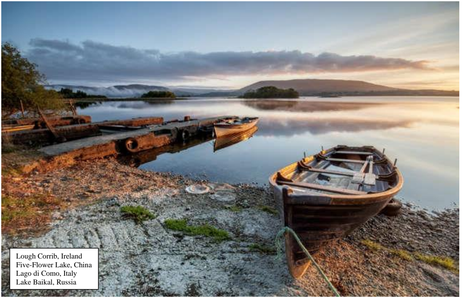
Lough Corrib, Ireland Five-Flower Lake, China Lago di Como, Italy Lake Baikal, Russia