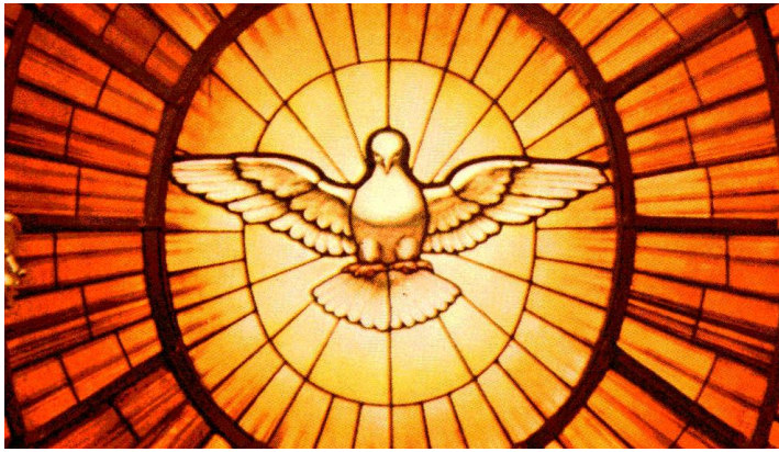
Photo above: The alabaster window of the Holy Spirit is in the Apse wall above the Cathedra Petri in St. Peter Basilica, Vatican City.