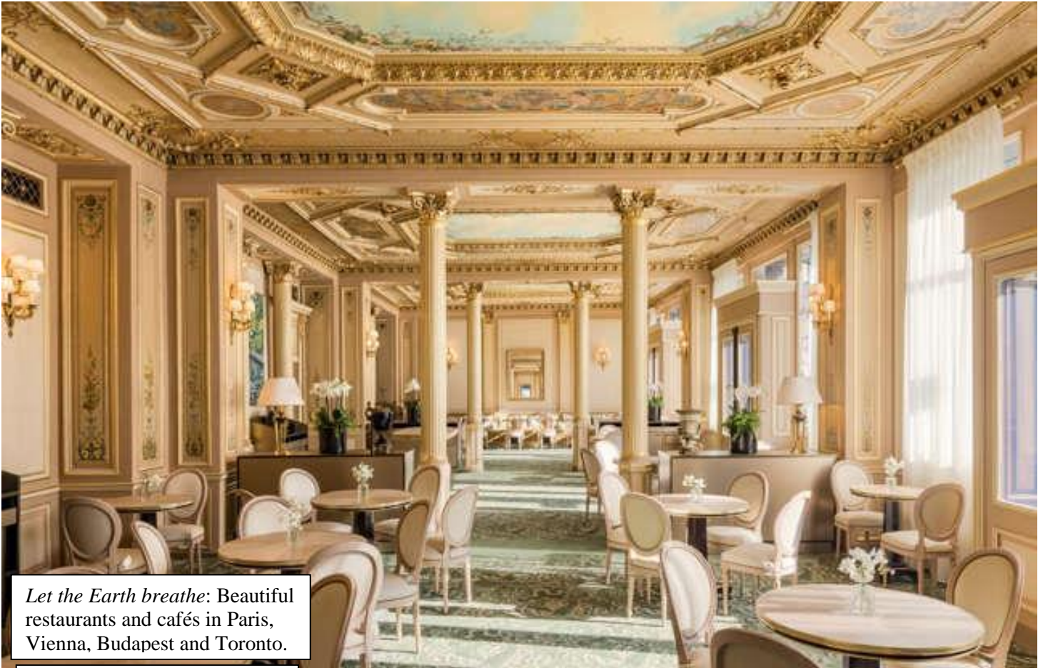
Let the Earth breathe: Beautiful restaurants and cafés in Paris, Vienna, Budapest and Toronto.